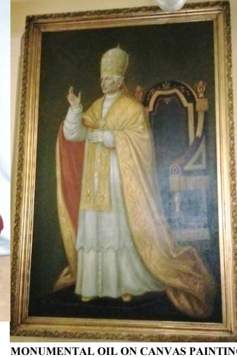
MONUMENTAL OIL ON CANVAS PAINTING OF POPE LEO XIII 96T, 63W