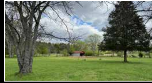
MLS#: 2639120 - Tract 5 Rutledge Ln