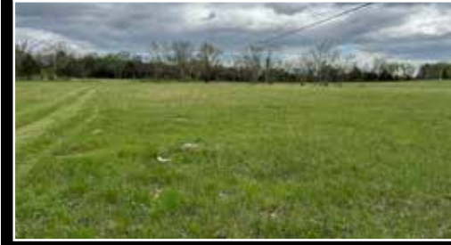
MLS#: 2639113 - 222 & 244 Rutledge Ln