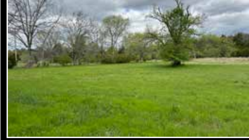
MLS#: 2639116 - Tract 2 Rutledge Ln