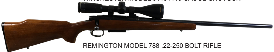
REMINGTON MODEL 788 .22-250 BOLT RIFLE