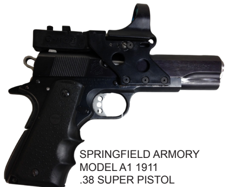
SPRINGFIELD ARMORY MODEL A1 1911 .38 SUPER PISTOL

QUALITY CONSIGNMENTS BEING ACCEPTED FOR THIS AUCTION. CALL NOW (740) 344-4282