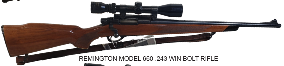
REMINGTON MODEL 660 .243 WIN BOLT RIFLE