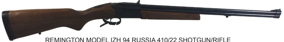
REMINGTON MODEL IZH 94 RUSSIA 410/22 SHOTGUN/RIFLE