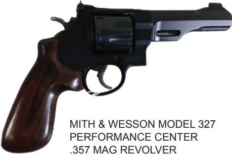
SMITH & WESSON MODEL 327 PERFORMANCE CENTER .357 MAG REVOLVER