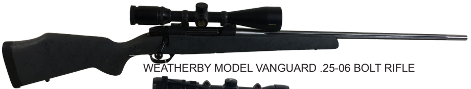
WEATHERBY MODEL VANGUARD .25-06 BOLT RIFLE