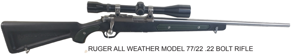
RUGER ALL WEATHER MODEL 77/22 .22 BOLT RIFLE