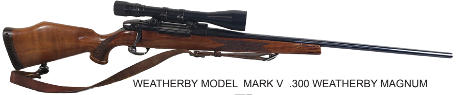
WEATHERBY MODEL MARK V .300 WEATHERBY MAGNUM