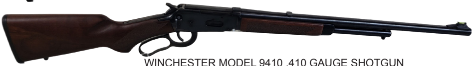
WINCHESTER MODEL 9410 .410 GAUGE SHOTGUN