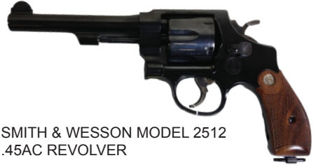
SMITH & WESSON MODEL 2512 .45AC REVOLVER