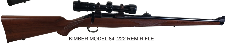
KIMBER MODEL 84 .222 REM RIFLE