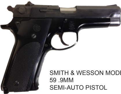
SMITH & WESSON MODEL 59 .9MM SEMI-AUTO PISTOL