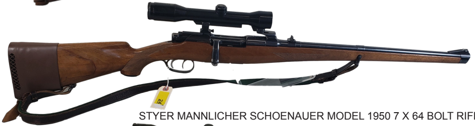
STYER MANNLICHER SCHOENAUER MODEL 1950 7 X 64 BOLT RIFLE