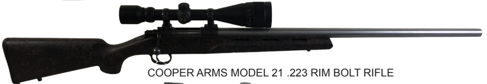
COOPER ARMS MODEL 21 .223 RIM BOLT RIFLE