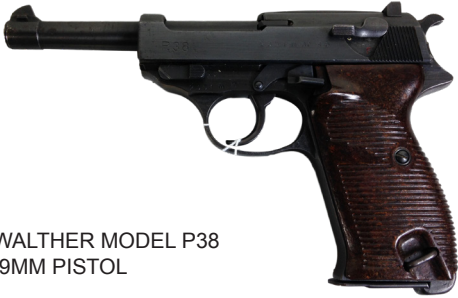
WALTHER MODEL P38 .9MM PISTOL