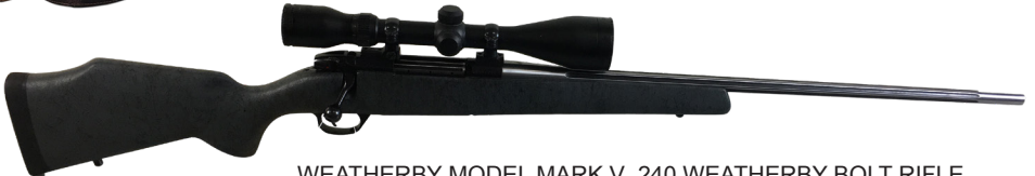
WEATHERBY MODEL MARK V .240 WEATHERBY BOLT RIFLE