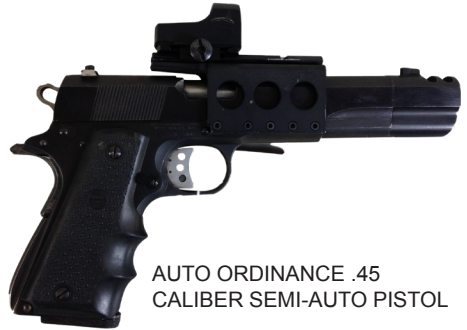
AUTO ORDINANCE .45 CALIBER SEMI-AUTO PISTOL