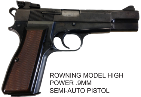
ROWNING MODEL HIGH POWER .9MM SEMI-AUTO PISTOL

QUALITY CONSIGNMENTS BEING ACCEPTED FOR THIS AUCTION. CALL NOW (740) 344-4282