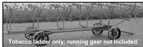
Tobacco ladder only; running gear not included.

Andy Grothe Auctioneer LLC AU003417L 717.629.2071 agauctioneer@yahoo.com