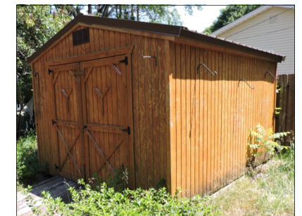
(2) Storage & Tool Sheds