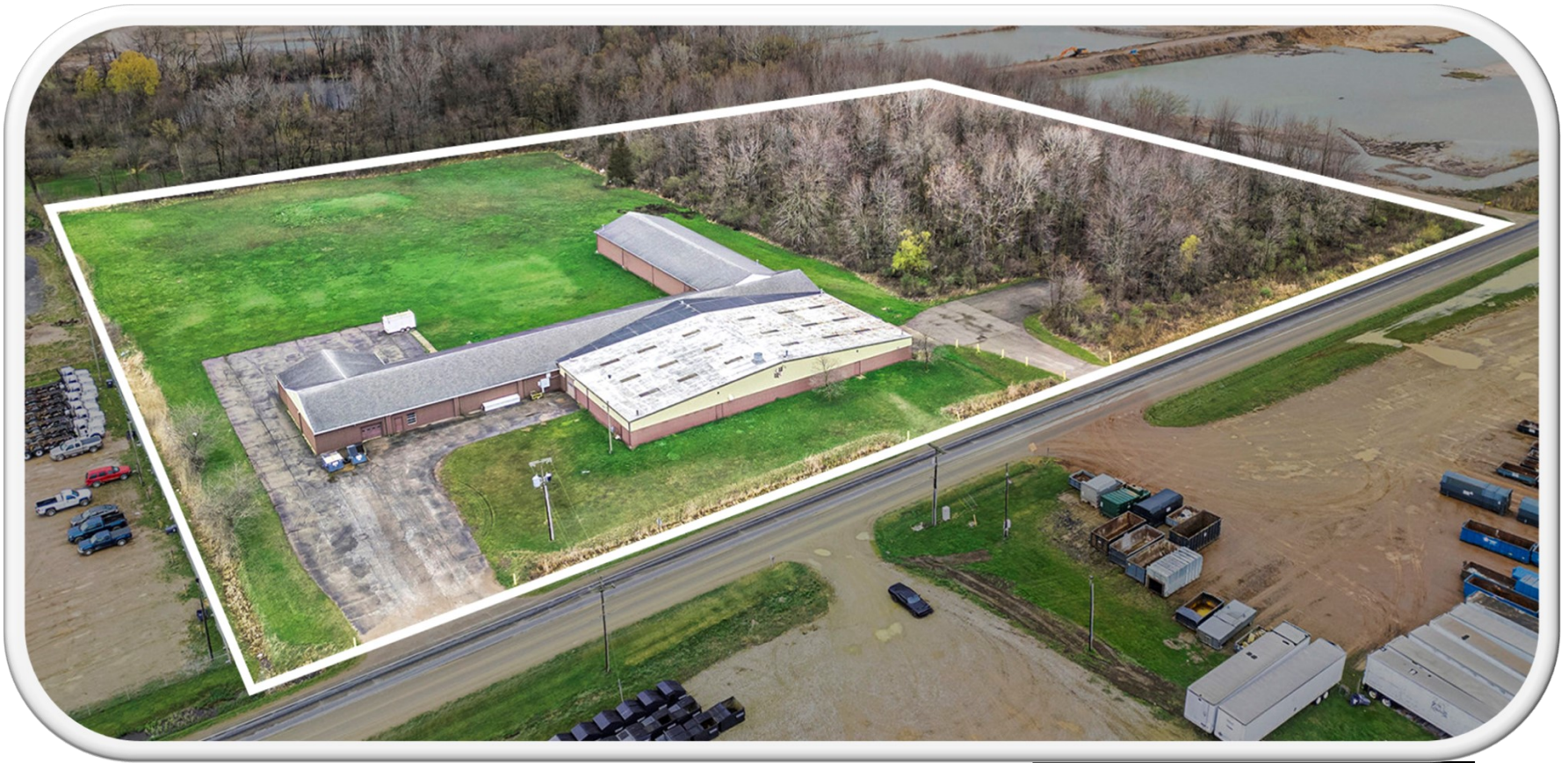
Aerial View - 11.73 Acres