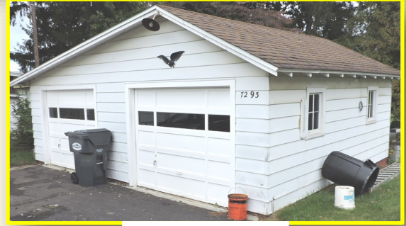
2 CAR GARAGE