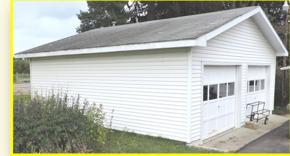
2 BAY SHOP W/AIR COMPRESSOR