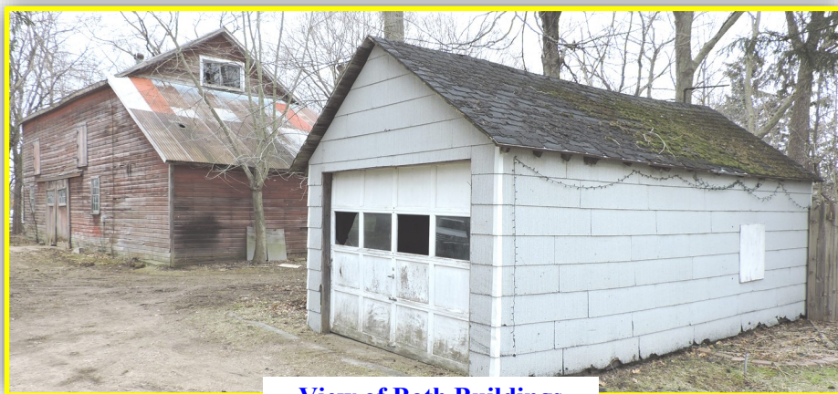
View of Both Buildings