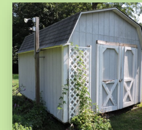
TOOL SHED 10' X 12'