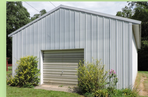
POLE BARN 24' X 40'