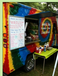
Lunch Box by "Celena"

TERMS: CASH, Good Check or Credit/Debit Card w/Proper I.D. & 5% office fee - Not responsible for accidents or goods after sold. All items are being sold in "AS-IS" condition. Announcements made day of auction supersede any printed material. Pre-View morning of the Auction.