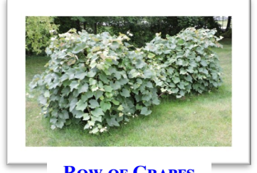
ROW OF GRAPES

Real Estate Offered At 11:00 A.M. The S. 1/2 of Lots 11 & 12 Blk 2 Village of Bridgman Large Lot - Approx. 1 Acre -5 Bedroom 2 Bathroom Home (2,944+/- Sq. Ft.) -Added All Season Room -Basement with Outside Access -Cedar Dry-Heat Sauna in Basement -Back Deck w/Ramp -Gas Hot Water Heat -Large Shade Trees, Small Row of Grapes -City Water & Sewer -Most Replacement Windows on Main Floor -2 Car Detached Garage (24' X 26') -Bridgman Schools -City of Bridgman -#11-56-0019-0120-00-8 -2020 Taxes: S. $2,698.32 W. $111.59 -Assessed 128,600 x 2 = $257,200 assessors opinion