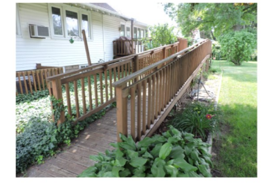
RAMP TO DECK