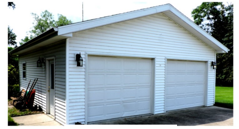
2 CAR GARAGE