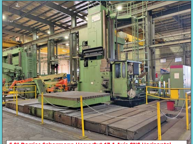
5.9' Dorries Scharmann HeavyCut 1Z 4-Axis CNC Horizontal Table Type Boring Mill