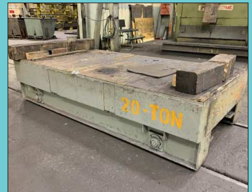
1 of 2 HD Transfer Carts