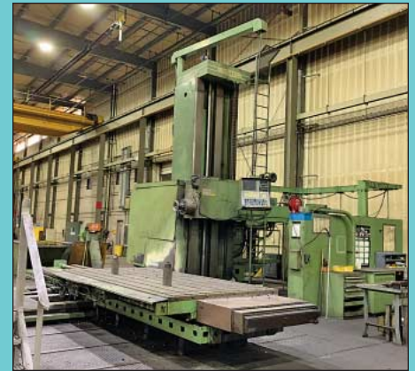
(2) 6' Giddings & Lewis H60-TX 3-Axis CNC Horizontal Table Type Boring Mills