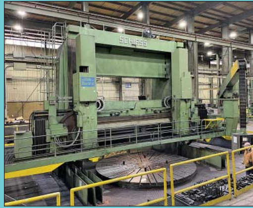
Schless 3K 500/600 NC/C 2-Axis CNC Vertical Boring Mill