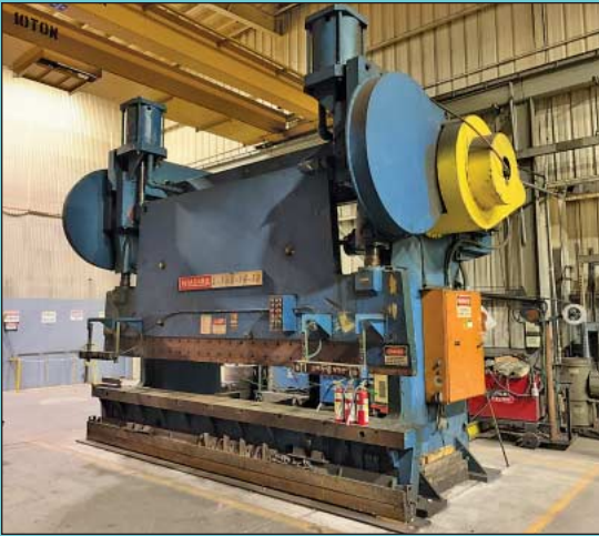
750 Ton Niagara Model L-750-14-18 Mechanical Press Brake