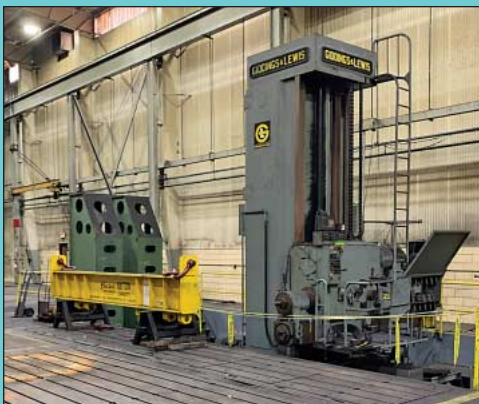
7' Giddings & Lewis N7UF 3-Axis Manual Horizontal Floor Type Boring Mill