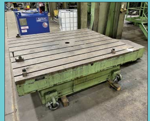
(4) Spare Rotary Tables up to 7' X 8'