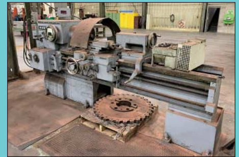
20" x 60" Lodge & Shipley LS-AVS Engine Lathe

Large Quantity of Shop & Support Equipment; including Lifting Chains, Hooks, Invincible Model 460 Vacuum System; s/n 451181, 1/2 HP, 24" Arm, Single Sided Cantilever Rack w/ 6-Shelves & 4-Uprights, Pedestal Fans, Steel Horses, 2-Door Cabinets, Steel Benches