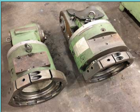
Right Angle Milling Head Attachments