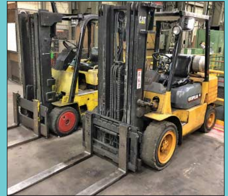
(2) CAT LP Gas Lift Trucks up to 7,000 LB