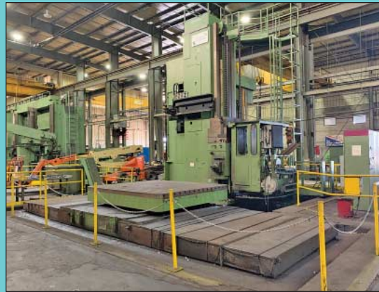
5.9' Dorries Scharmann HeavyCut 1Z 4-Axis CNC Horizontal Table Type Boring Mill (1992)