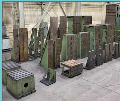
Large Quantity HD Angle Plates