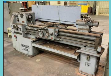
14" x 68" Hercules Ajax Lathe