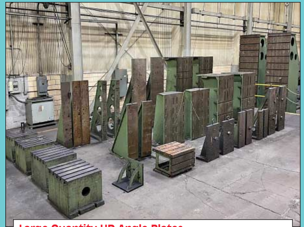
Large Quantity HD Angle Plates