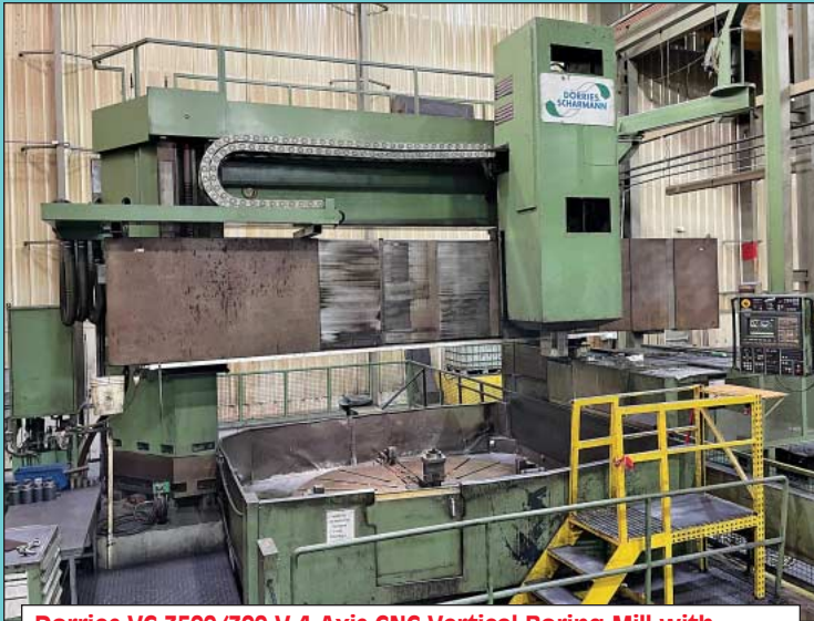
Dorries VC 3500/300 V 4-Axis CNC Vertical Boring Mill with Y-Axis Milling

INSPECTION: Wednesday, March 17th from 10AM to 4PM