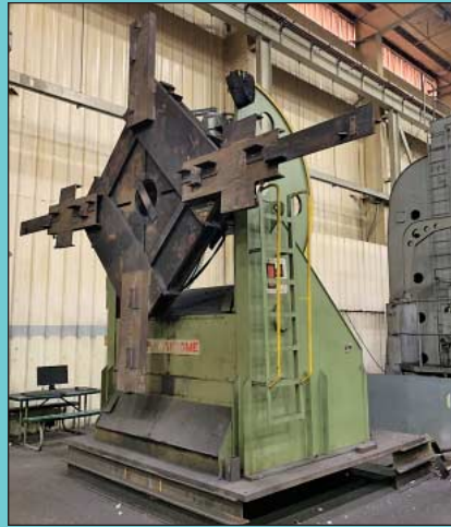
35,100 LB Ransome 600P Welding Positioner