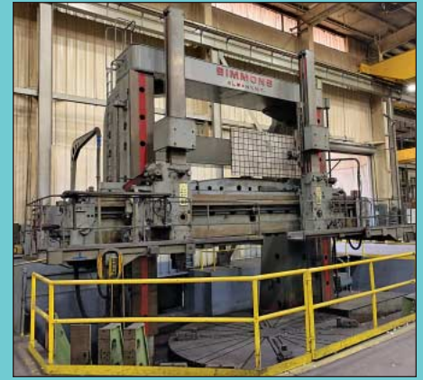
Simmons/Skoda SK-50A Manual Tracer Vertical Boring Mill