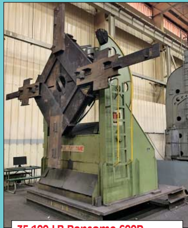
35,100 LB Ransome 600P Welding Positioner