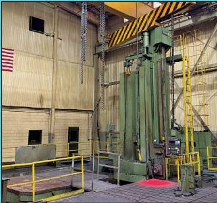
6.3' Toshiba BSF-160G 4-Axis CNC Horizontal Floor Type Boring Mill