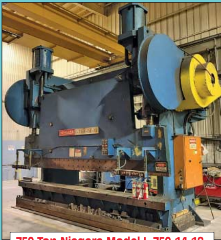
750 Ton Niagara Model L-750-14-18 Mechanical Press Brake