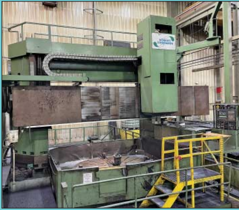
Dorries VC 3500/300 V 4-Axis CNC Vertical Boring Mill with Y-Axis Milling (1992)