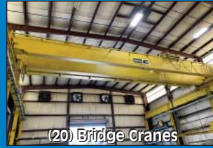
(20) Bridge Cranes