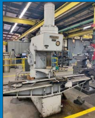
75 Ton Oil Gear Straightening Press