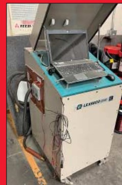
Large Quantity Electric Motor Test Equipment