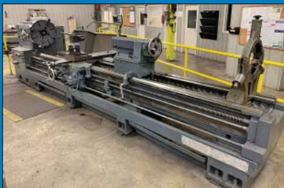
(8) Engine Lathes to 60" x 240" by Mazak and Others