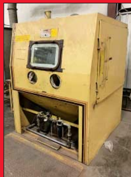
4' Empire Blast Cabinet w/ Rotary Table