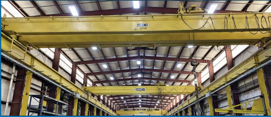
20-Ton, 10-Ton and 5-Ton x 60' Span Conco Overhead Bridge Cranes w/ Radio Remote