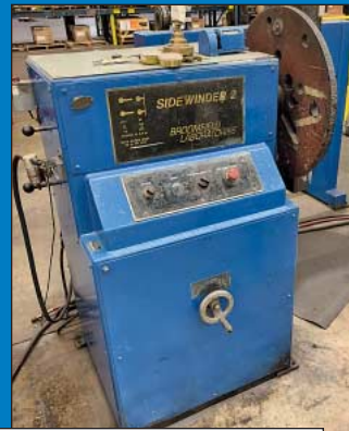
Large Quantity Electric Motor Test and Rebuild Equipment