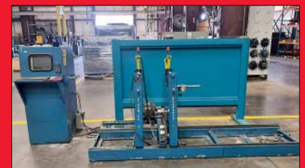
Dynamic and Static Shaft Balancers