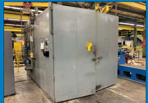
(10) Late Model Burn-Off Ovens to 8' x 8' x 12'