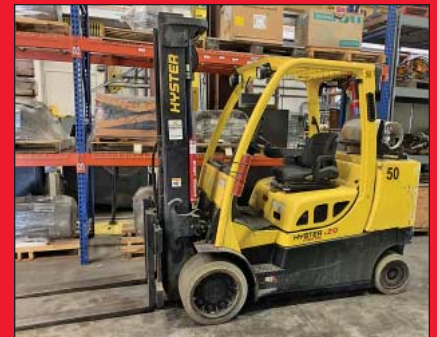
12,000 Lb. Hyster S120FT-PRS LPG Lift Truck, 3,000 Hours