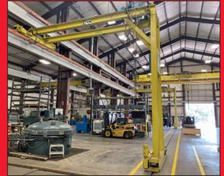
(2) 5 Ton x 25' Shawbox Single Leg Gantry Cranes