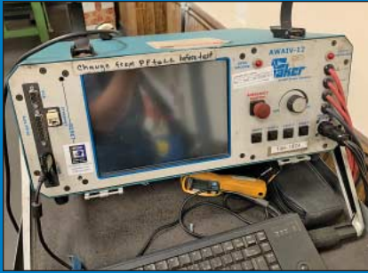
Large Quantity Electric Motor Test and Rebuild Equipment