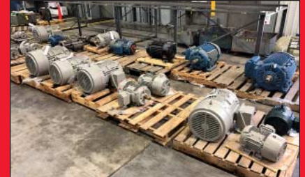
(50) New Electric Motors from 5-HP to 200-HP

20" x 48" Lodge AVS Engine Lathe; **Out of Service**