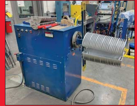
(2) ACE Model 3ASI Armature Winders