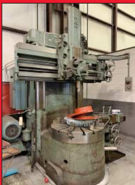
42" Bullard Cutmaster Vertical Turret Lathe