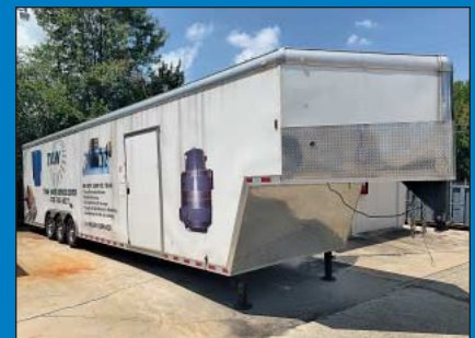
2018 - FVCG 36' Enclosed Gooseneck Trailer

Very Clean Factory Support Equipment; Heavy Duty Repair Tables, Maintenance Tools, Job Boxes, Parts Washers, Fireproof Cabinets, Platform Scales, Racks