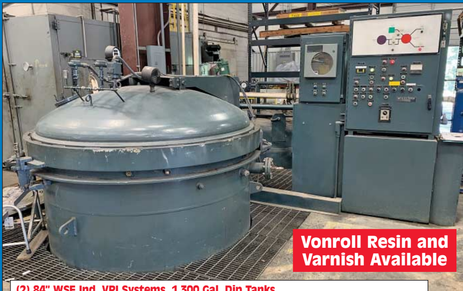
(2) 84" WSF Ind. VPI Systems, 1,300 Gal. Dip Tanks

INSPECTION: Day prior to Each Auction from 10:00 AM to 4:00 PM or by appointment with jeffjr@cia-auction.com