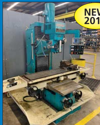
7.5-HP Clausing Model SUP8BV Bed Mill

7.5-HP Clausing Model SUP8BV Bed Mill; s/n 151225, 16" x 62" Table, DRO, PB Control (New 2015)