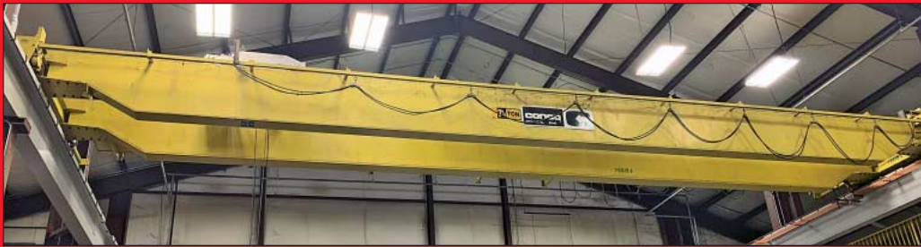
20 Ton and 7.5 Ton x 60' Span Conco Overhead Bridge Cranes, Radio Remote