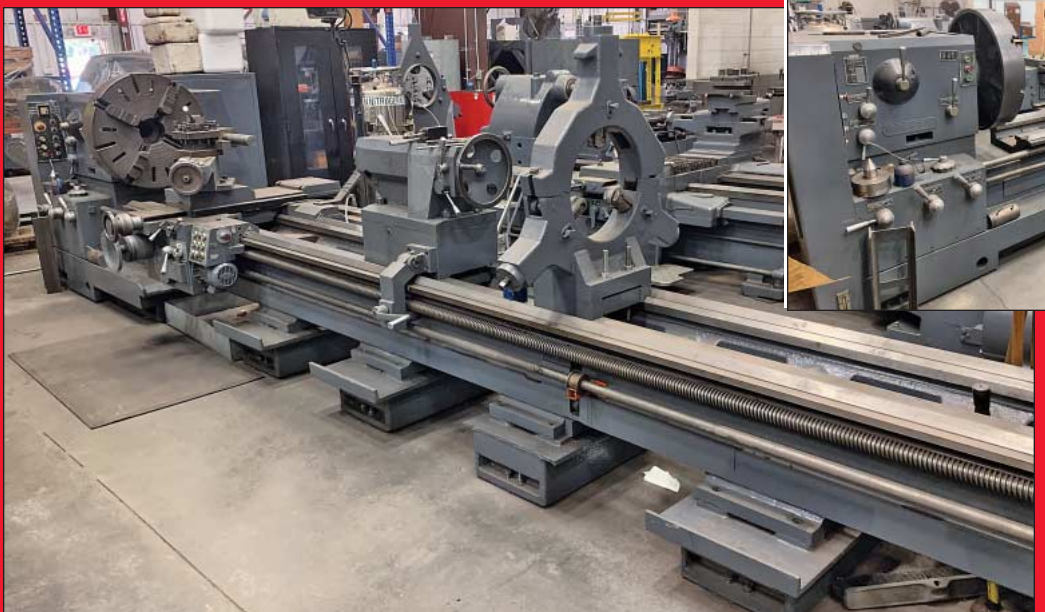
40" / 48" x 220" Poreba TPK-90/5M Gap Bed Engine Lathe