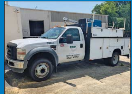
Late Model Service and Pick-Up Trucks

4" Summit Rotary Table Horizontal Boring Mill; s/n 140.39/609, 4' x 5' Rotary Table, DRO