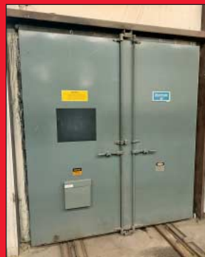
7' x 8' x 8' Steelman Burn-Off Oven