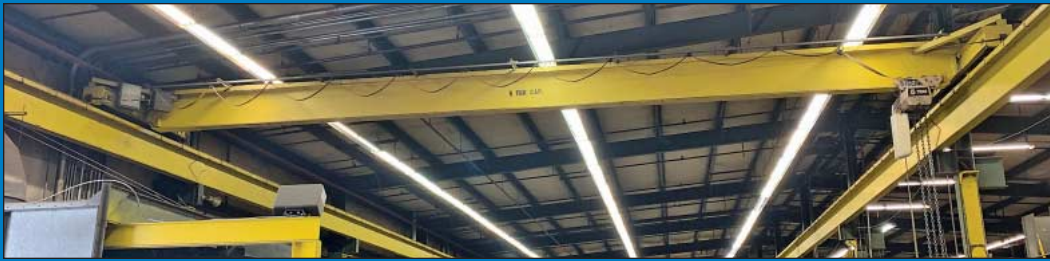
(10) 5-Ton and 3-Ton Single Girder Overhead Bridge Cranes