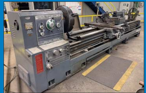
(15) Engine Lathes to 60" x 240"