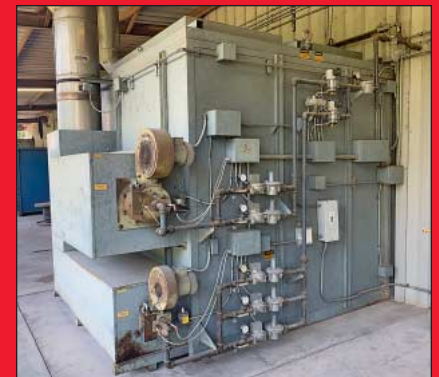
Rear View Steelman Burn-Off Oven