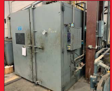
(5) Burn-Off Ovens to 7' x 7' x 12'