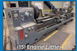
(15) Engine Lathes