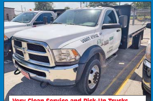
Very Clean Service and Pick-Up Trucks