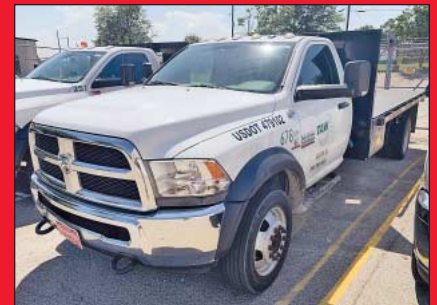
2013 Dodge Ram 5500 Flat Bed Truck, Cummins, 134K

Very Clean Support Equipment; Adjustable Beam Pallet Rack, Fireproof Cabinets, Oxy-Torch Carts, Die Lift Cart, Warehouse Cart, Electric Hoists, and Related