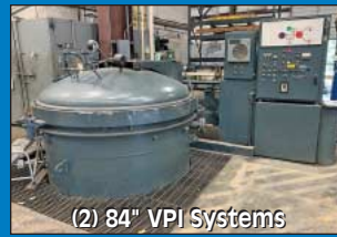
(2) 84" VPI Systems

Contact Information 2020 Dunlap St. Cincinnati, Ohio 45214 Phone 513-241-9701 Fax 513-241-6760 www.cia-auction.com