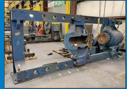
600-Ton Watson Stillman Hydraulic Wheel Press