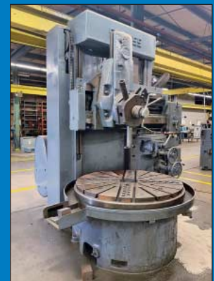
60" Schiess Vertical Turret Lathe