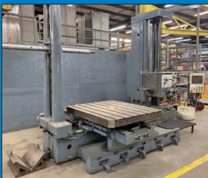
4' Summit Rotary Table Horizontal Boring Mill