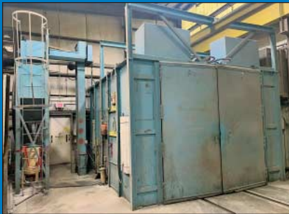
14' x 16' x 10' High Approx. Drive-In Blast Booth