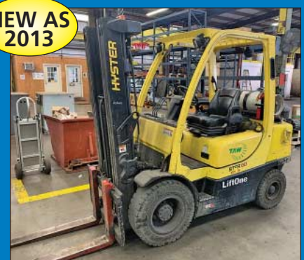
(3) Forklifts to 10,000 Lb. Cap.