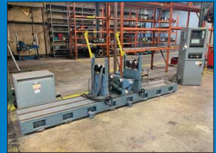
Dynamic and Static Shaft Balancers