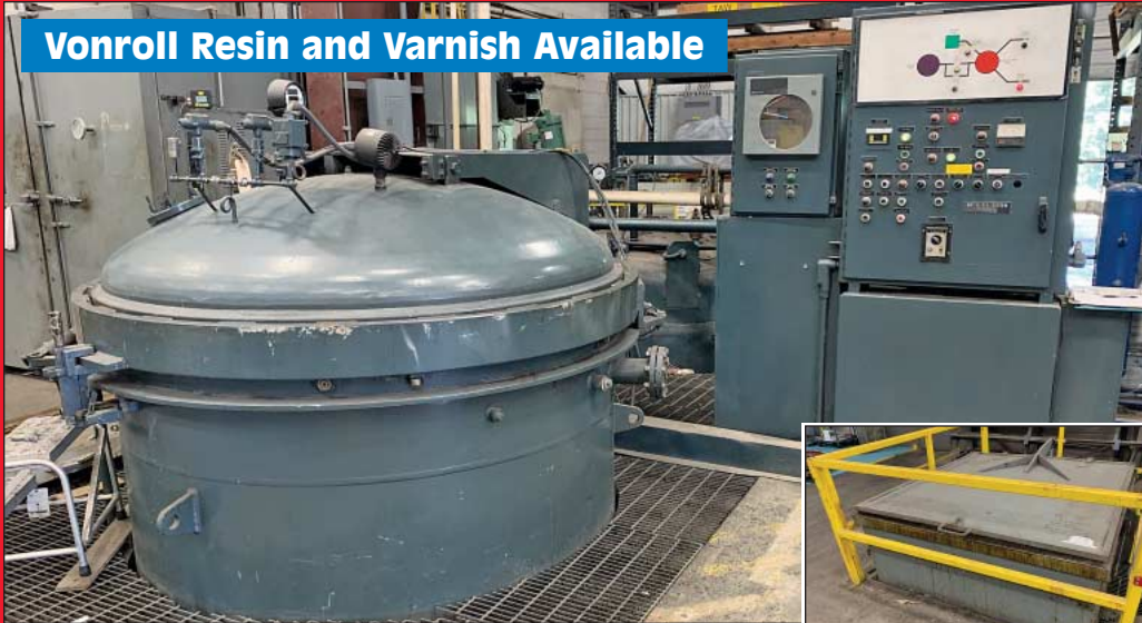
84" WSF Industries (VPI) Vacuum Pressure Impregnation System