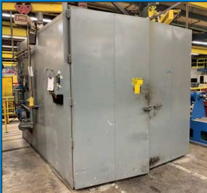
(5) Burn-Off Ovens to 8' x 8' x 12'