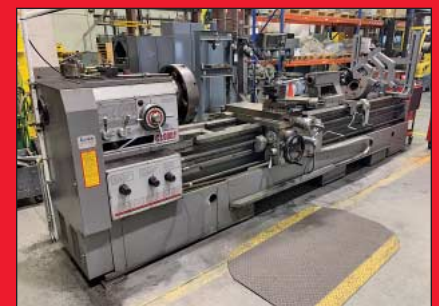
30" / 40" x 156" and 120" Lion Gap Bed Engine Lathes