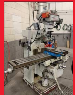
Toolroom Machinery, Mills, Drills, Grinders, Presses