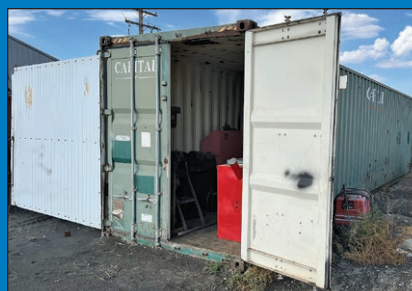
(2) 40' & (1) 20' Containers