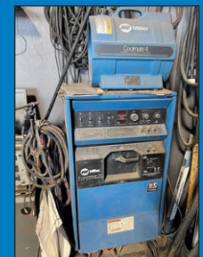
(2) 350 Amp Miller Syncrowave 351 Tig Welder with Cooler