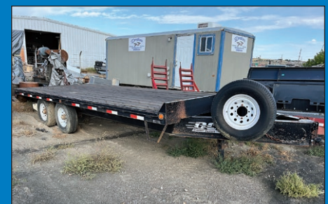
(5) 18' Steel and Wood Deck Tandem Axle Trailers