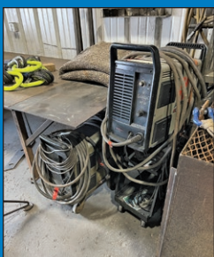
Hypertherm & Miller Plasma Cutters