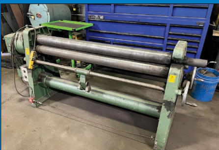
10 Ga. x 5' Roundo Model IP-110/5 Plate Rolls