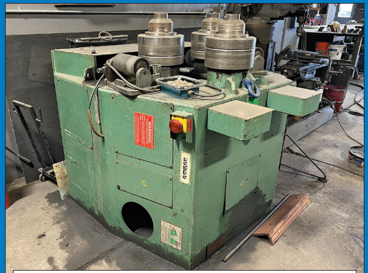
3.5" x 3.5" x 3/8" Roundo Model R-4 Hydraulic Angle Rolls