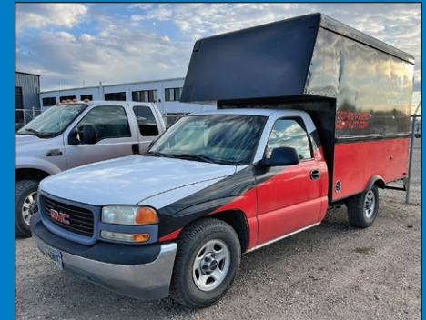
2001 GMC Box Truck with 60,000 Miles