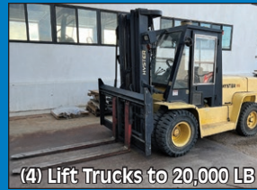
(4) Lift Trucks to 20,000 LB