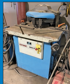
Euromac Model AV220/6 Notcher