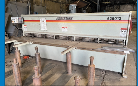
1/4" x 12' Accurshear Model 625012 Shear (2003)