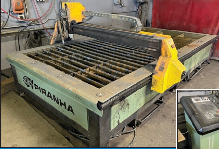
5' x 10' Piranha Model C510 CNC Plasma Table (2018)