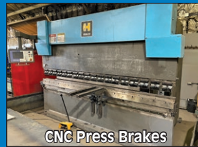
CNC Press Brakes

Contact Information 2020 Dunlap St. Cincinnati, Ohio 45214 Phone 513-241-9701 Fax 513-241-6760 www.cia-auction.com