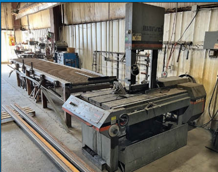
18" Marvel 8 Mark-II Tilt Frame Vertical Band Saw