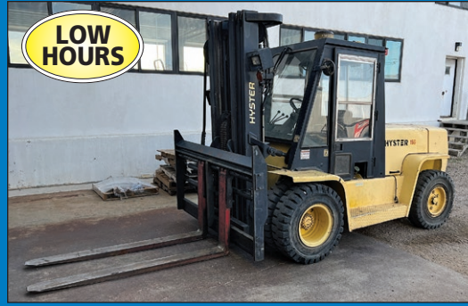
15,500 Lb. Hyster Model H155XL Diesel Dually Pneumatic Tire Lift Truck