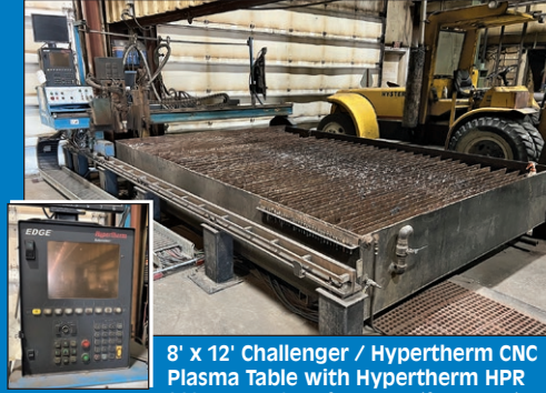
8' x 12' Challenger / Hypertherm CNC Plasma Table with Hypertherm HPR 260 Power Supply (Hypertherm Retro Fit Control in 2020)