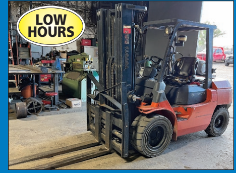
(2) 7,000 Lb. Toyota Model 7FGCU35 LP Gas Pneumatic Tire Lift Trucks

Millermatic 141 Welder Bailiegh Weld Positioner (10) Other Misc Welders by Miller & Lincoln 8' x 20' H.D. Steel Layout Table