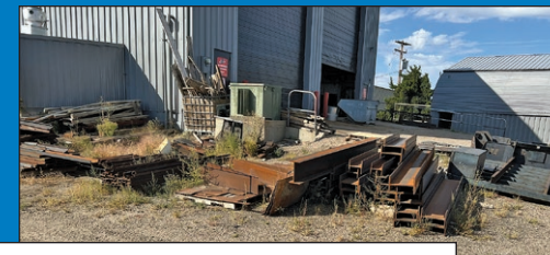
Large Quantity of Raw Steel Including Square Tube, I-beam & More