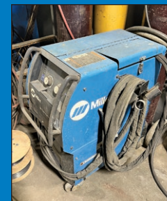
350 Amp Miller 350P Welder