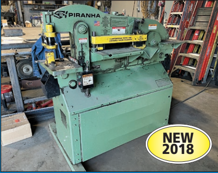
65 Ton Piranha P65 Ironworker (2018)