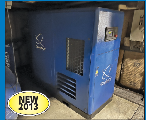
40 HP Quincy Model QGB-40 Air Compressor (2013)