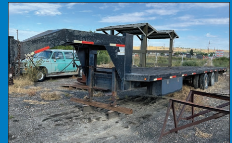
2006 - 32' Ameritrail GN32-6202 Wood Deck Gooseneck Trailer