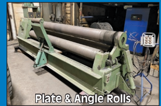
Plate & Angle Rolls