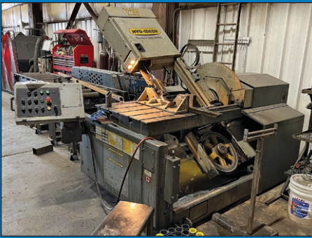
18" Hydmech Model V-18 Tilt Frame Vertical Band Saw