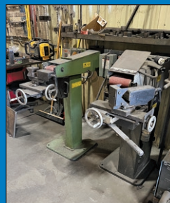
6" Jancy & 4" Almi Pipe Notcher Belt Sanders