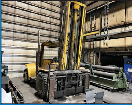
20,000 Lb. Hyster Model H200 Diesel Dually Pneumatic Tire Lift Truck