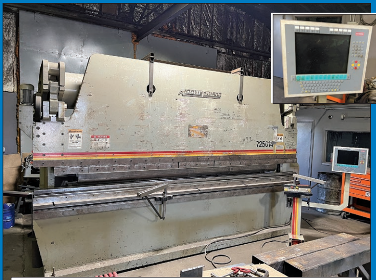
250 Ton x 14' Accurpress 725014 CNC Press Brake (Retrofitted Control)