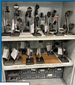
Complete Modern Lab, Keyence Measuring System, Tensile Tester, Hardness Tester and Inspection Equipment