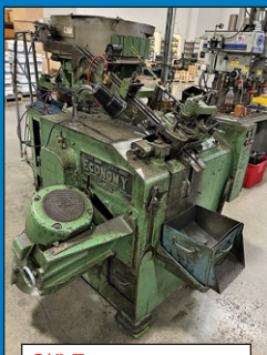
¾" Economy Pointer