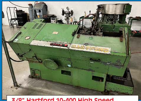
3/8" Hartford 10-400 High Speed Thread Roller