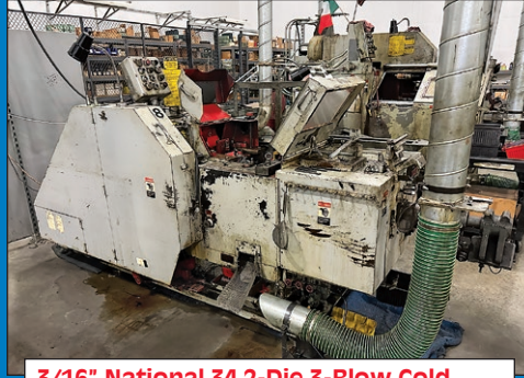
3/16" National 34 2-Die 3-Blow Cold Header