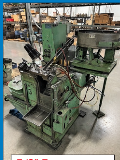
3/8" Economy Pointer