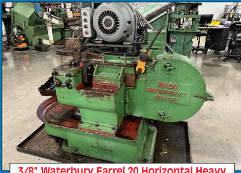
3/8" Waterbury Farrel 20 Horizontal Heavy Frame Hand Feed Thread Roller, Adjustable Pitman and Extended Die Pocket