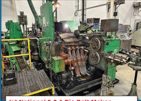
½" National S-2 4-Die Bolt Maker