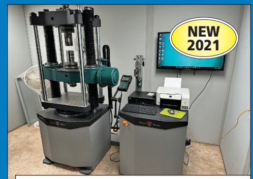
Tinus Olsen 600SL Tensile Tester (2021)