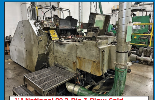
1/2" National 89 2-Die 3-Blow Cold Header (Built 1979)