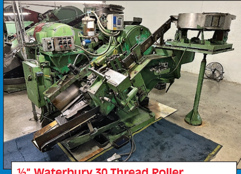
½" Waterbury 30 Thread Roller