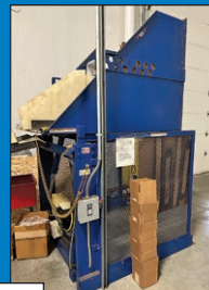
Late Model Support Equipment, Forklifts, Air Compressors, Shop Offices and Parts Handling Equipment