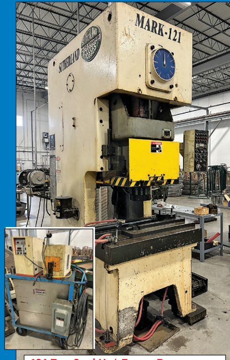
121 Ton Seyi Hot Forge Press, Induction Heat, Sliding Table, Bottom KO, Spring Head