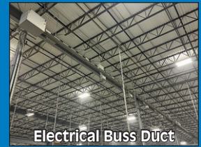
Electrical Buss Duct