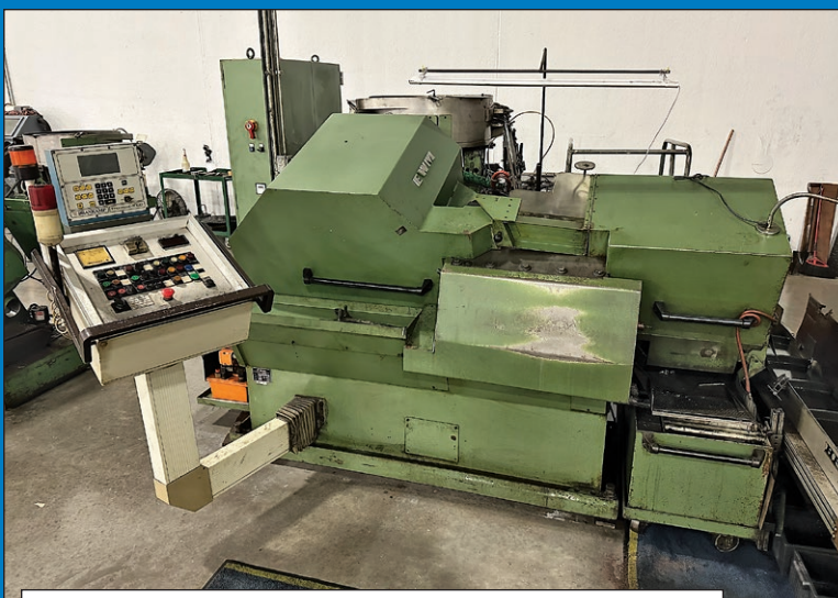
5/8" EW Menn GW120H High Speed Thread Roller (1993)