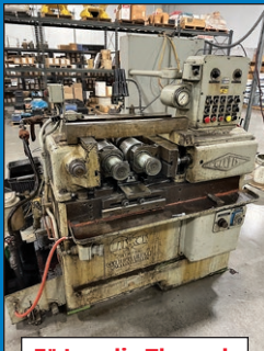
3" Landis Thread Roller