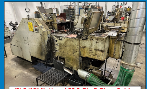
(2) 5/16" National 56 2-Die 3-Blow Cold Headers (Both Built Late 70's)