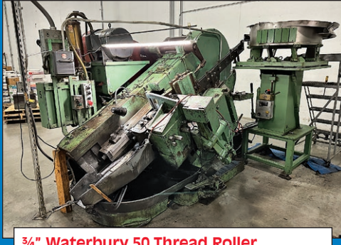
¾" Waterbury 50 Thread Roller