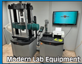
Modern Lab Equipment