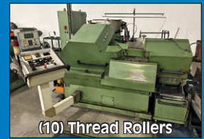
(10) Thread Rollers