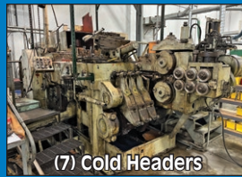
(7) Cold Headers

Contact Information 2020 Dunlap St. Cincinnati, Ohio 45214 Phone 513-241-9701 Fax 513-241-6760 www.cia-auction.com