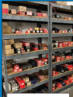
Thread Roll Dies