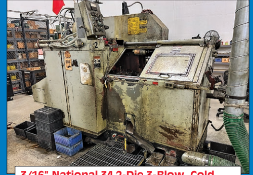
3/16" National 34 2-Die 3-Blow Cold Header