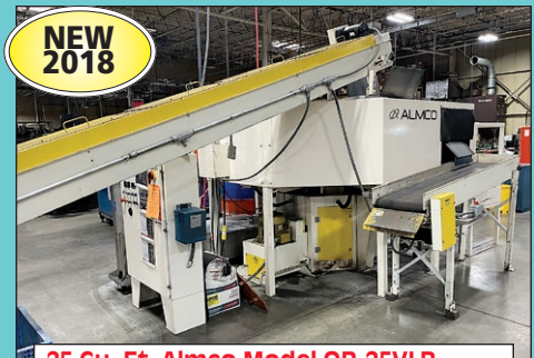
25 Cu. Ft. Almco Model OR-25VLR Vibratory Finishing Bowl