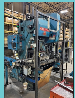
Bliss Model C60 and C35 OBI Presses