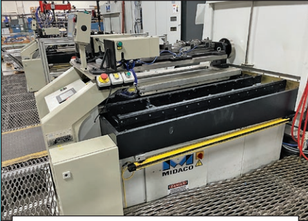
Midaco SS5020 Pallet Changers