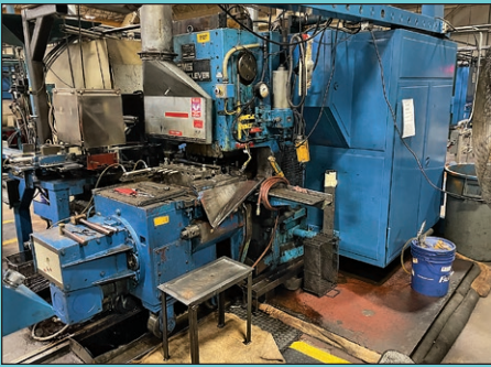
(2) 100 Ton Hasenclever Forging Machines w/ Induction Heaters