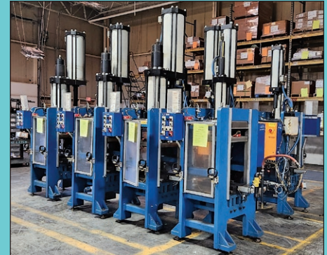
(25) Four-Post and C-Frame Air Oil Presses from 8 Ton to 80 Ton

(100+) Lots Office Equipment, File Cabinets, 2-Door Cabinets, Desks, Tables, Chairs