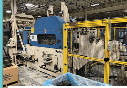
****15,000 Lb. x 18" x 1/2" Perfecto Precision Fineblanking Press Feed Line