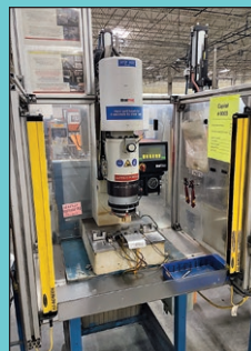
Baltec Orbital Riveters