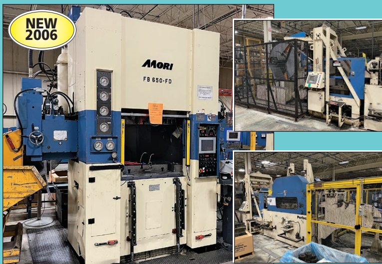
730 Ton Mori FB650-FD-BH Fineblanking Press and Perfecto Feed Line