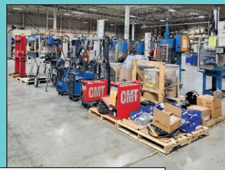
(250+) Lots of MRO Inventory, Shop and Support Equipment