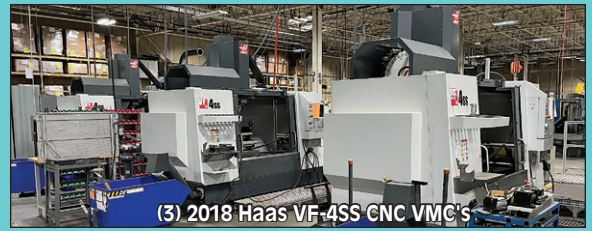
(3) 2018 Haas VF-4SS CNC VMC's

Contact Information 2020 Dunlap St. Cincinnati, Ohio 45214 Phone 513-241-9701 Fax 513-241-6760 www.cia-auction.com