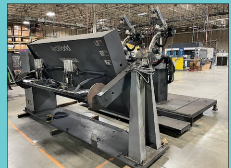
(3) Motoman Robotic Welding Cells w/ Access 450 Power Supplies