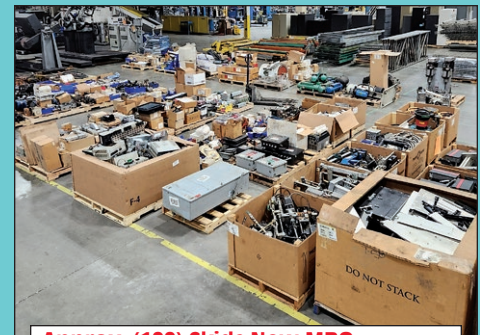
Approx. (100) Skids New MRO Inventory