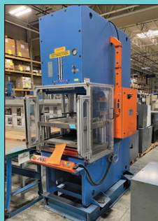
Hydraulic Presses by Neff and Multipress