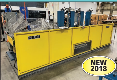
Ramco Model AMKD-24EWRRD Automated Wash Line

10 KW Ajax Toccoatron AC Portable Induction Heat System