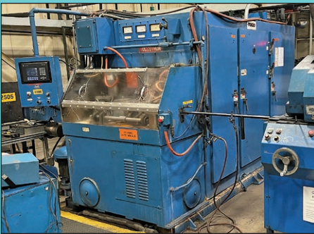
(2) 80 KW Tocco Toccoatron Induction Rod Heaters w/ Randbright Polishers