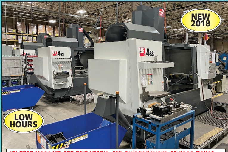
(3) 2018 Haas VF-4SS CNC VMC's, 4th Axis Indexers, Midaco Pallet Changers

INSPECTION: Day prior from 10:00 AM to 4:00 PM or by appointment with jeffjr@cia-auction.com