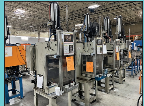
(25) Four-Post and C-Frame Air Oil Presses from 8 Ton to 80 Ton