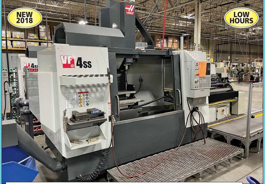
(3) Haas Model VF-4SS CNC VMC's w/ 4th Axis Indexers and Midaco Pallet Changers