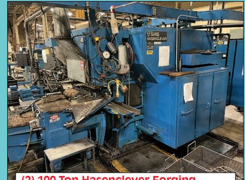
(2) 100 Ton Hasenclever Forging Machines w/ Induction Heaters