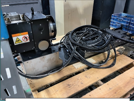
Haas HRT-210SP 4th Axis