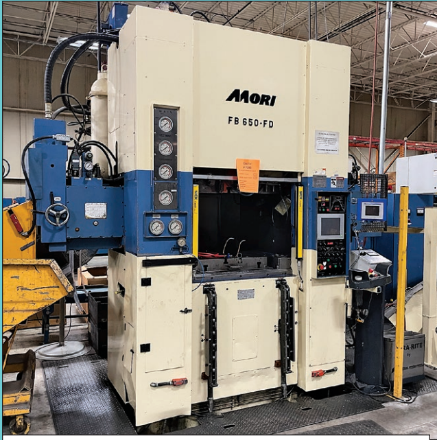
****730 Ton Mori FB650-FD-BH Fineblanking Press