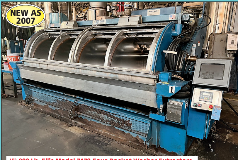
(5) 900 Lb. Ellis Model Z472 Four-Pocket Washer Extractors

INSPECTION: Day Prior from 10:00 AM to 4:00 PM or by appointment w/ joe@cia-auction.com