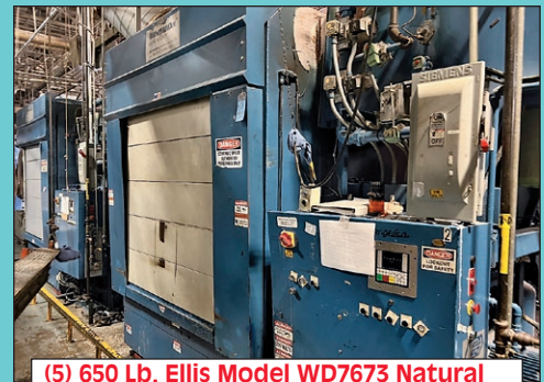
(5) 650 Lb. Ellis Model WD7673 Natural Gas Fired Batch Dryers