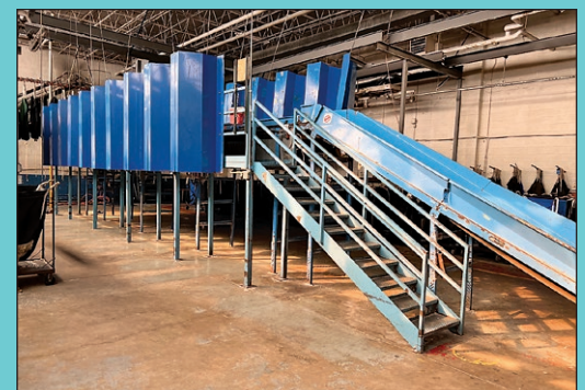
22-Station Soil Sort Conveyor & Mezzanine