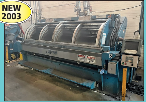
(2) 900 Lb. Ellis Model Z472R Four-Pocket Washer Extractors