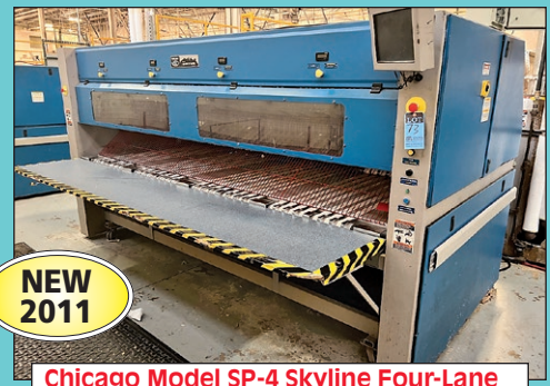
Chicago Model SP-4 Skyline Four-Lane Folder