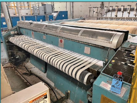
126" American Model 563 Super-Pro Three-Roll Ironer