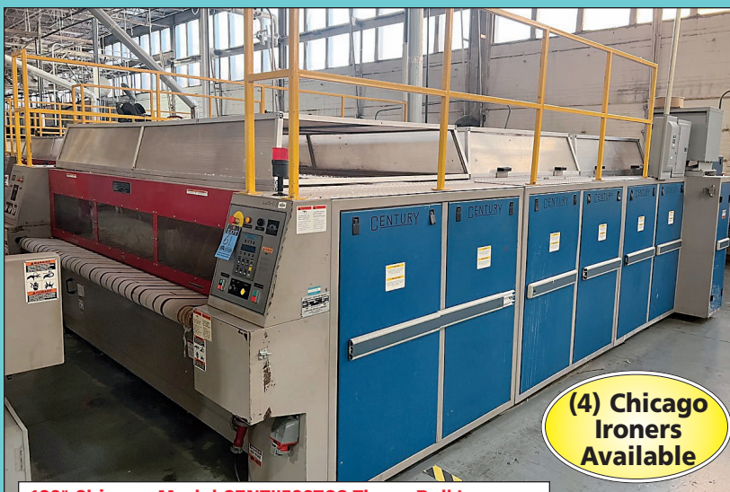
120" Chicago Model CENTI152STCC Three-Roll Ironer