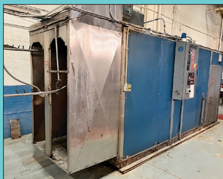
Colmac Model CTU-190 G/S RH Natural Gas Fired Pass-Thru Dry Cleaner