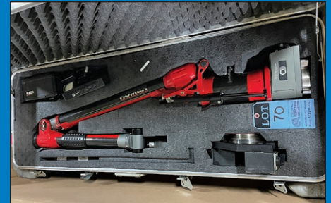
Romer Model 5124 CIM CORE Infinite 2.0 Portable Arm CMM