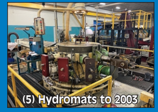
(5) Hydromats to 2003