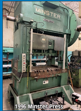
1996 Minster Press

Contact Information 2020 Dunlap St. Cincinnati, Ohio 45214 Phone 513-241-9701 Fax 513-241-6760 www.cia-auction.com