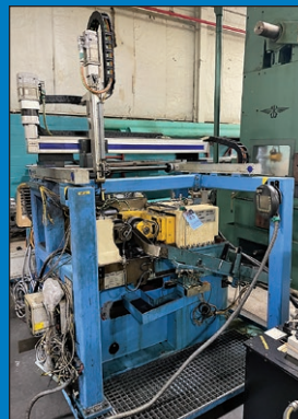
Pee Wee Model P20-8G CNC / AC Two-Die Cylindrical Thread Roller

40 Ton Rouselle Model 4 OBI Press; s/n 23862, 3" Stroke, 12" Shut Height, 3.5" Adjustment, 105 SPM, PB Control, Air Clutch