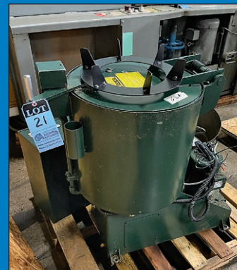
Barrett Chip Wringer