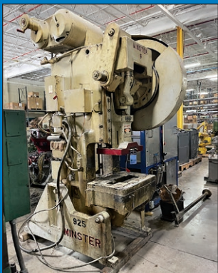
60 Ton Minster No. 6 OBI Press