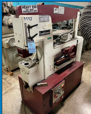
65 Ton Scotchman Ironworker