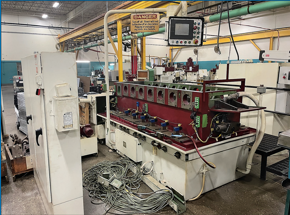
Hydromat Inline-8 Transfer Machine