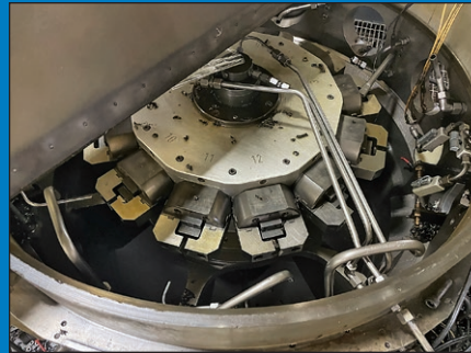
Hydromat 14/16-Station Inline Transfer Machine