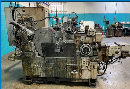
Cincinnati Milacron Model 220-8 DR Centerless Grinder