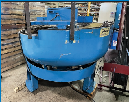
Roto-Finish Model MP-70 Vibratory Feed Bowl