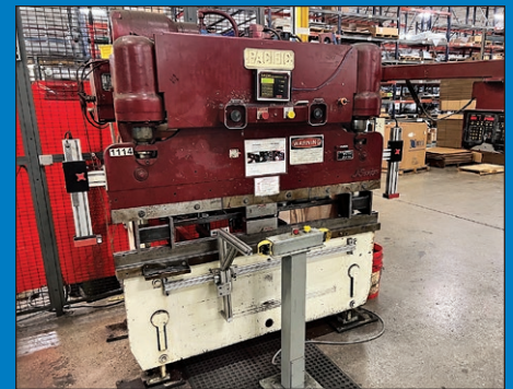
55 Ton x 6' Pacific Model J55-6 Hydraulic Press Brake