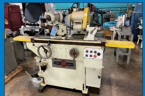
Parker Majestic Model 1C Universal ID OD Cylindrical Grinder