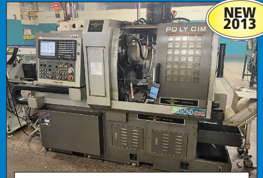
Poly Gim Diamond 42CSL CNC Swiss Lathe