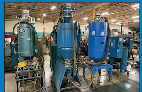
Plastic Auxiliary Equipment, Material Dryers, Sprue Pickers, Granulators