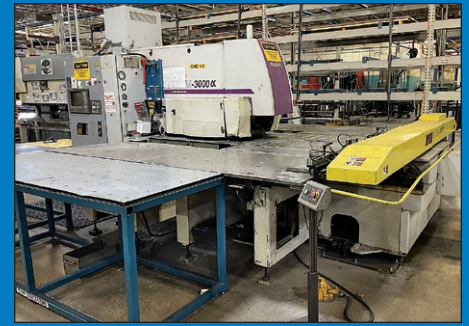
30 Ton Muratec Vectrum 3000 Alpha CNC Turret Punch