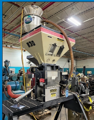
Maguire Material Blender