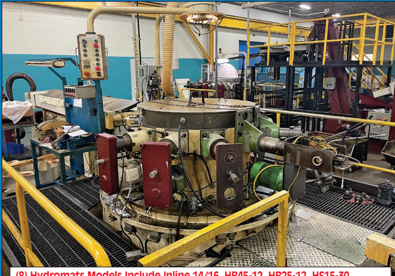
(8) Hydromats Models Include Inline 14/16, HB45-12, HB25-12, HS15-30, Trunion V8

INSPECTION: Day Prior from 10:00 AM to 4:00 PM or by appointment w/ jeffjr@cia-auction.com