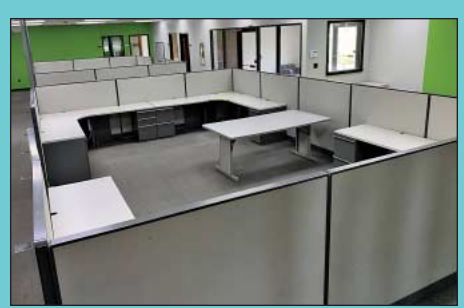
Late Model Office Furniture, Cubicles & Break