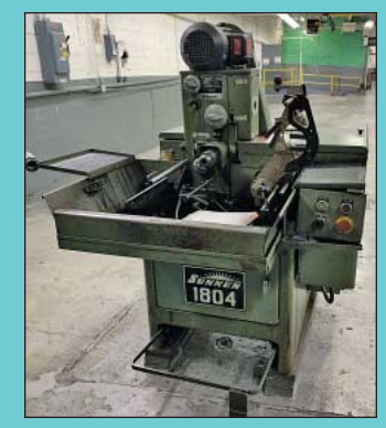
Sunnen MBC-1804 Horizontal Honing Machine