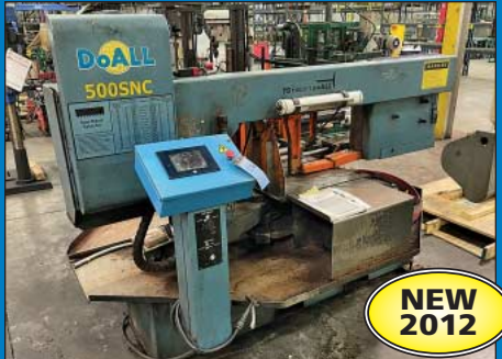
14" x 20" DoAll 500SNS Swivel Auto Horizontal Band Saw