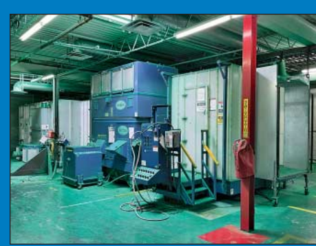
(2) Nordson XL-2002 Surecoat Electrostatic Powder Coating Paint Booths