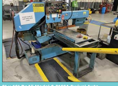
9" x 16" DoAll Model C-916SA Swivel Auto Horizontal Band Saw

Office Desks and Tables with Chairs, Cubicle, Conference Room Tables, Nurse's Beds, File Cabinets, Shelving, Mini Refrigerator, Cabinets, Lockers, Tables, Sofa Chairs, Scale, Bench, Tables, Folding Tables, Chairs, Microwaves, Refrigerators, Shelving, Cabinets, Projectors, Projector Screens, Ice Maker, BluRay Player, Microphone Sound System, Etc.