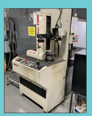
Parlec Series 1000 Tool Presetter TMM