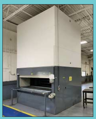
Kardex Titan Vertical Storage System