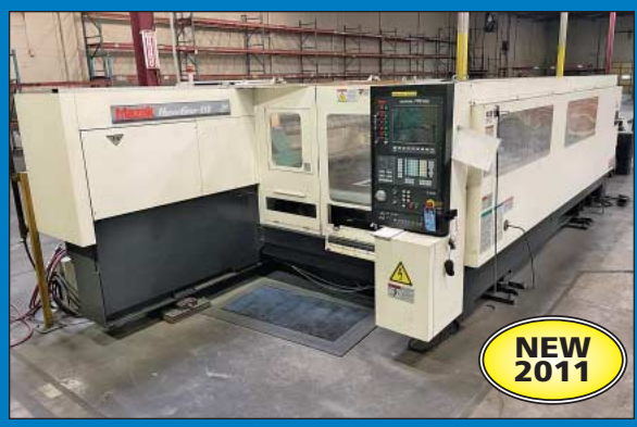
4,400 Watt Mazak HyperGear-510 CNC C02 Laser