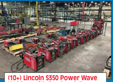
Welders with Feeders & Booms