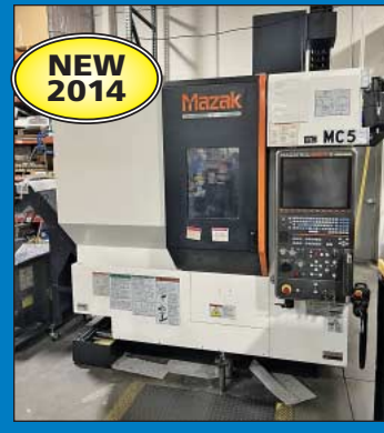
Mazak VCU 500 5X 5-Axis CNC Vertical Machining Center