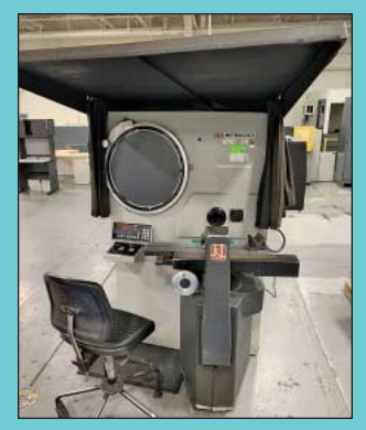
J&L Epic 20 Optical Compactor