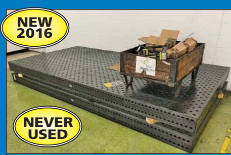
(2) Siegmund Demmler Style Welding Tables