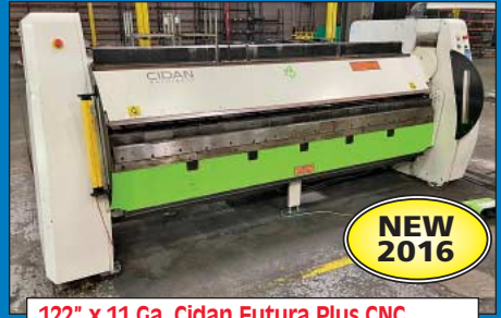
122" x 11 Ga. Cidan Futura Plus CNC