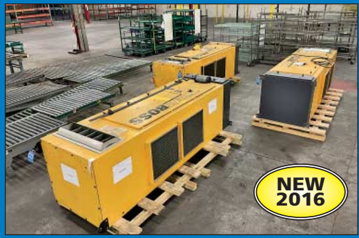
(6) Fume & Dust Collectors by RoboVent, Torit & Vent Boss

Large Quantity of Shop & Support Equipment: (5+) Pallets of Misc. Hand Tools, Carts, Roller Conveyor, DE Grinder,