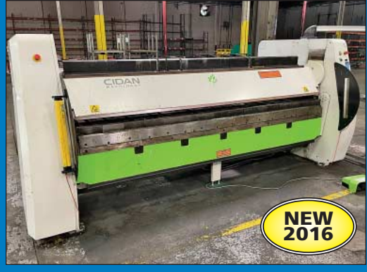
122" x 11 Ga. Cidan Futura Plus CNC Folder