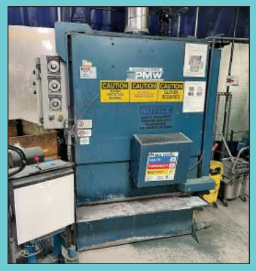
PMW Model 612 HD Parts Washer