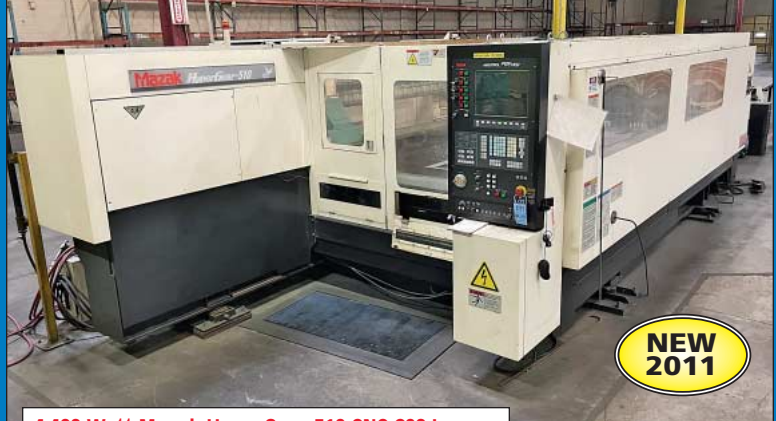
4.400 Watt Mazak HyperGear-510 CNC C02 Laser

INSPECTION: Wednesday, July 6th from 10:00 AM to 4:00 PM or by appointment with ryan@cia-auction.com