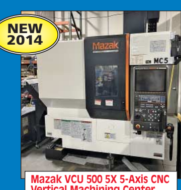
Vertical Machining Center