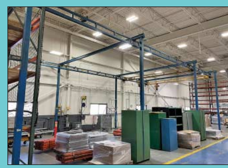
(4) Gorbel Free Standing Bridge Crane System