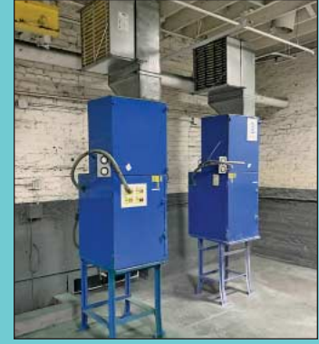
(5) Torit Dust Collectors

Belt Sander, Notcher, Arbor Press, Hydraulic Press, Yellow hinge Racks, 1818 Conduit Bender, Weld Curtains, Barrel Pumps, Hydraulic Pumps, Sump Pumps, Hydraulic Lift Tables, Air Hose Reels, Green Roll Around Baskets, Shop Vacs, Mop Buckets, Floor Fans, Wall Fans, Trash Cans, Electric Motors, Metal & Wire Shelving, Lock Pocket Baskets, Lid Carts, Weld Carts, Plastic Push Carts, Blue Wooden Crate Stands, Green Engineering Work Kiosks, Roll Around Tool Cabinets, (2) Granite Tables, Air & Electric Hoists, Stack Bins, Work Benches, Miscellaneous Maintenance Supplies, 5,000 LB Floor Scale, Pallet Jacks, Strapping Kits, 16 Ton Roller Skate Kit, Bishamon Skidlifts, Guardrail