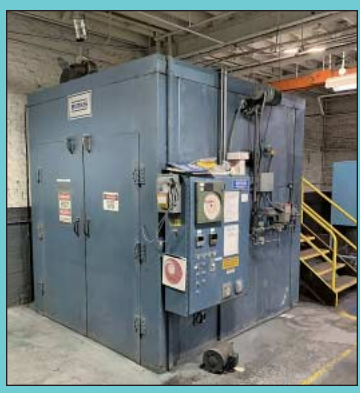
Binks BWN-68-7G Natural Gas Oven