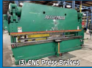
(3) CNC Press Brakes