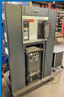
Miller Auto Continuum 350 Power Supply