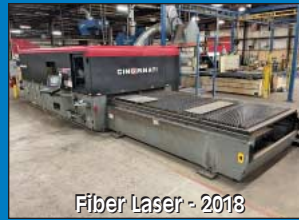
Fiber Laser - 2018

Contact Information 2020 Dunlap St. Cincinnati, Ohio 45214 Phone 513-241-9701 Fax 513-241-6760 www.cia-auction.com