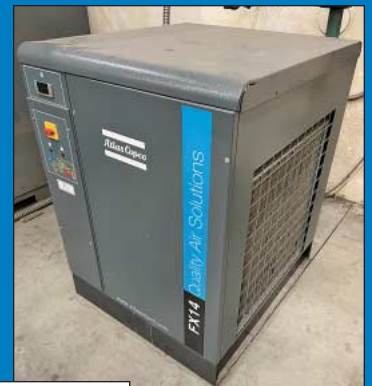
(5+) Air Compressors & Dryers by Atlas Copco, Quincy and Others (New as 2012)