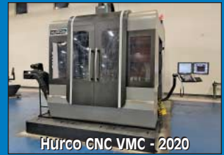
Hurco CNC VMC - 2020