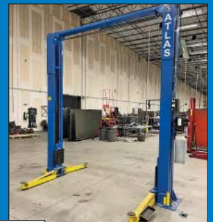
HD Steel and Aluminum Plate, (100+) Sections of Pallet Rack and (5) Atlas Car Lifts