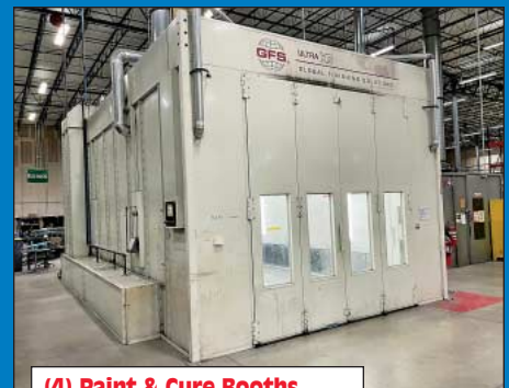
(4) Paint & Cure Booths