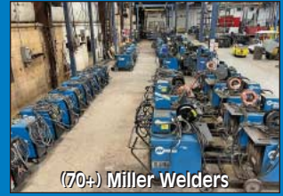
(70+) Miller Welders