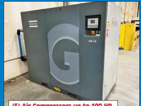
(5) Air Compressors up to 100 HP