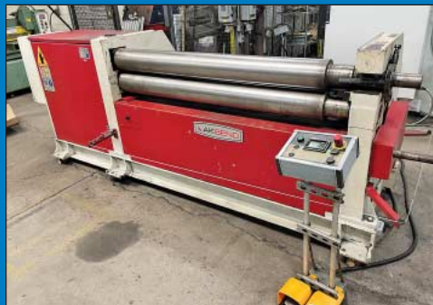
5' x 5/16" AKBEND ASM-S 170-15/7.0J Plate Bending Roll