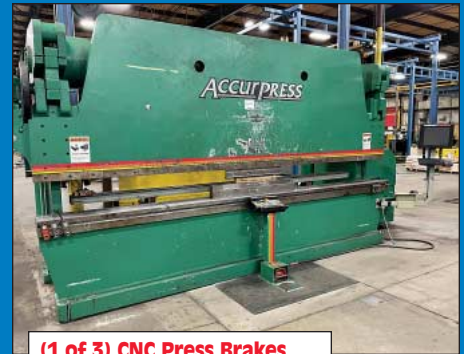
(1 of 3) CNC Press Brakes