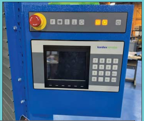
Kardex Remstar Model Shuttle-XP-500-2450X864-US Vertical Storage Carousel