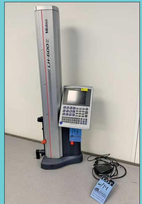
24" Mitutoyo Model LH-600E Digital Height Gauge

Tray 230KG - 490KG, 10' x 11' x 32' High Overall Dimensions, (85) 96" x 36" Trays Total, (30) Heavy Trays at 1,800 Lb. Capacity, (28) Medium Trays at 794 Lb. Capacity, (27) Light Trays at 507 Lb. Capacity, Power Pick Global Inventory Software (New 2019)