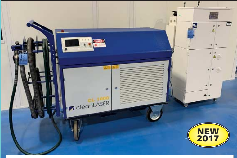
1,000-Watt Clean Laser Model CL1000 Laser