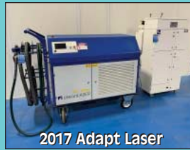
2017 Adapt Laser