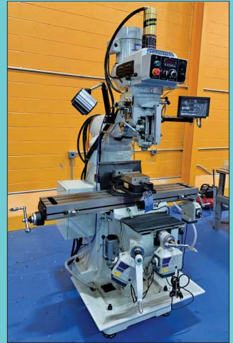
3HP AM Metalmaq Model 3VS-EVS Vertical Mill