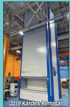
2019 Kardex Remstar