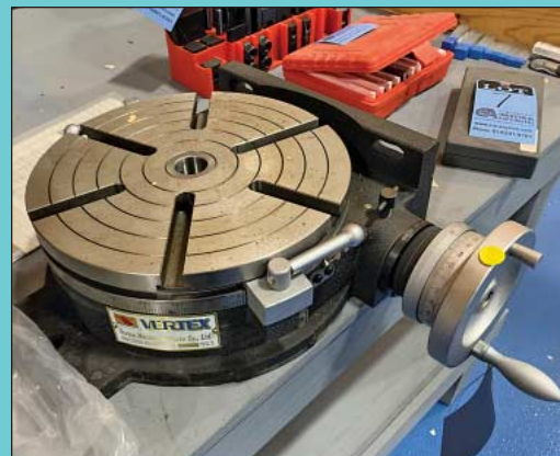
12" Vertex Rotary Table