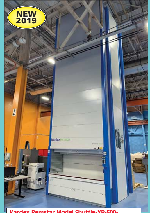
Kardex Remstar Model Shuttle-XP-500-2450X864-US Vertical Storage Carousel