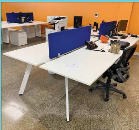
Late Model Office Furniture

Breakroom Furniture, Refrigerator, Microwave, (5) Stools, (2) Tables, (8) Chairs