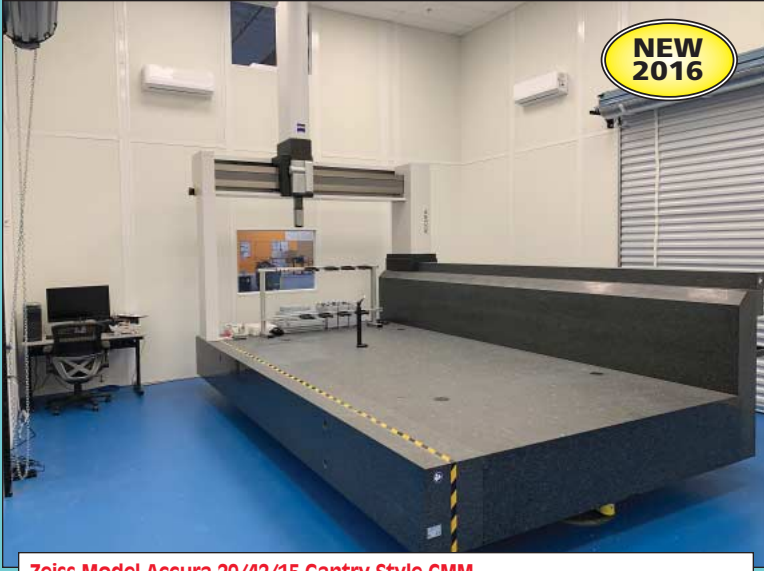
Zeiss Model Accura 20/42/15 Gantry Style CMM

INSPECTION: Day Prior from 10:00 AM to 4:00 PM or by appointment with joe@cia-auction.com