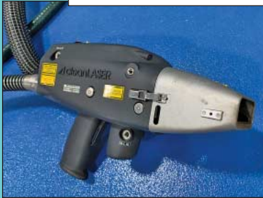
1,000-Watt Clean Laser Model CL1000 Laser