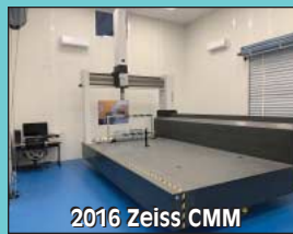
2016 Zeiss CMM

Contact Information 2020 Dunlap St. Cincinnati, Ohio 45214 Phone 513-241-9701 Fax 513-241-6760 www.cia-auction.com