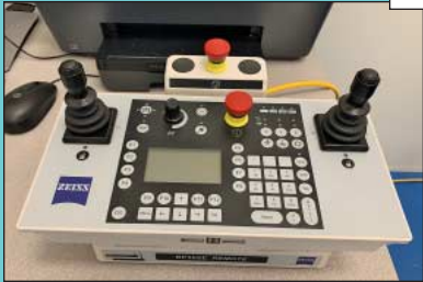
Zeiss Model Accura 20/42/15 Gantry Style CMM