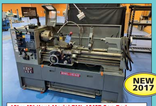
16" x 40" Kent Model RML-1640T Cap Bed Lathe