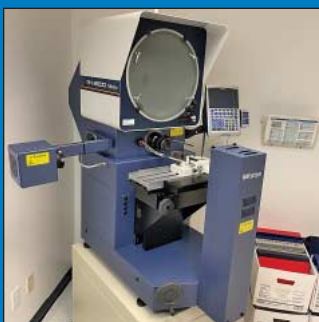
Mitutoyo PH-3500 Comparator