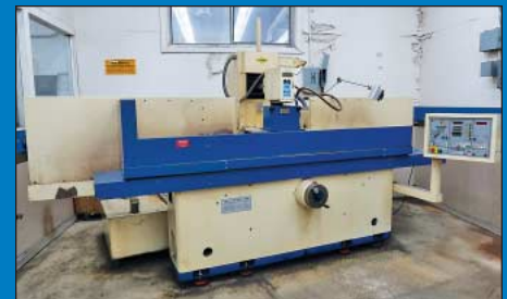
15" x 61" ELB Optical 1035-NC-K Hydraulic Surface Grinder