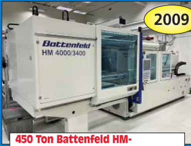
450 Ton Battenfeld HM-4000/3400 Injection Molder