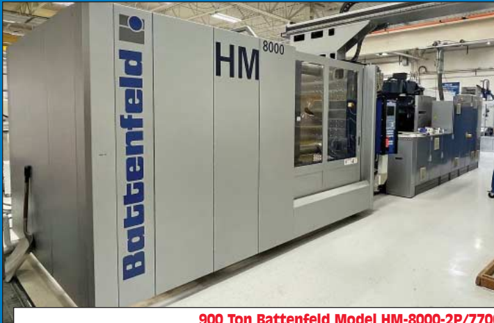
900 Ton Battenfeld Model HM-8000-2P/7700 Plastic Injection Molding Machine

INSPECTION: Day Prior from 10:00 AM to 4:00 PM or by appointment with jeffjr@cia-auction.com