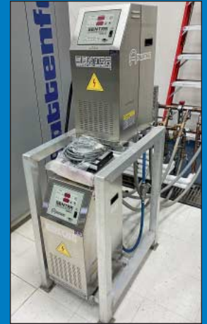
(25) Sentra 2000LE Mold Temp Controllers

19.29" x 19.29" Platen Size, 12.6" x 12.6" Distance Between Tie Bars, 12.8" Opening Stroke, 18.7" Max Daylight, 5.9" Min Mold Height, Approx. 5,300 Lb. (to 2000)