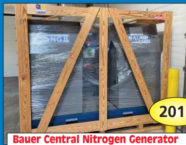
Bauer Central Nitrogen Generator System (2015 - Never Installed)