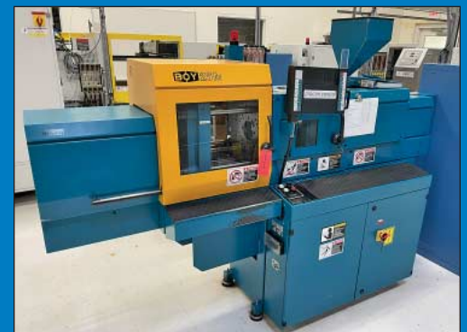
25 Ton Boy Model 25M Plastic Injection Molding Machine