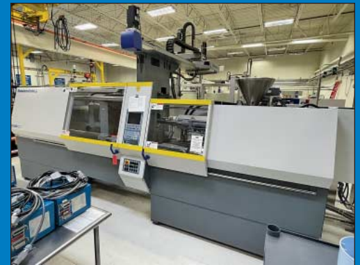
(2) 220 Ton Battenfeld Model BA-2000/1000 CDC Plastic Injection Molding Machines

(3) 44 Ton Battenfeld Model BA-400 CDC Plastic Injection Molding Machines; Model BA-400/50 s/n 23323 w/ .72 Oz. Shot, Unilog B4 Control (2000), Model BA400/50 s/n 20214 w/ .72 Oz. Shot, Unilog 4000 Control (1997), Model BA-400/125 s/n CC40934517720 w/ 1.89 Oz., Unilog TC40 Control (1996),