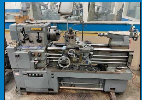
15" x 40" Mori-Seiki MS850 Engine Lathe