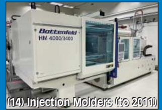
(14) Injection Molders (to 2011)