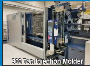
900 Ton Injection Molder

Contact Information 2020 Dunlap St. Cincinnati, Ohio 45214 Phone 513-241-9701 Fax 513-241-6760 www.cia-auction.com