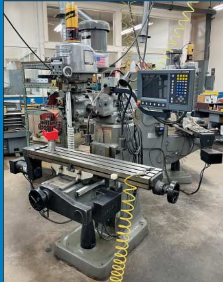
(2) 2-HP Bridgeport CNC Mills