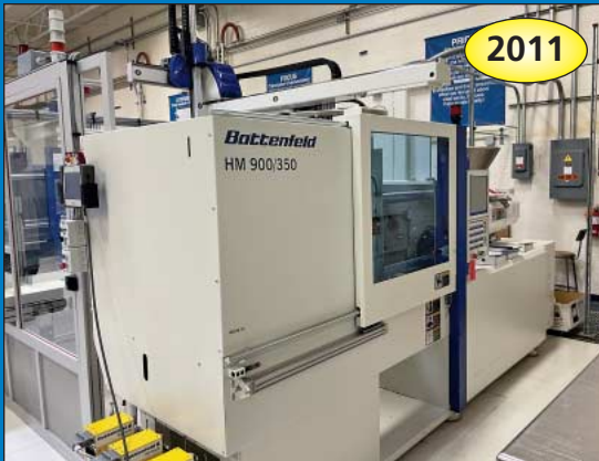
(2) 100 Ton Battenfeld Model HM-900/350 Plastic Injection Molding Machines