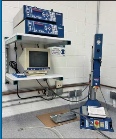
(2) Branson 2000AED Ultrasonic Welders