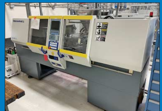
(3) 44 Ton Battenfeld Model BA-400 CDC Plastic Injection Molding Machines