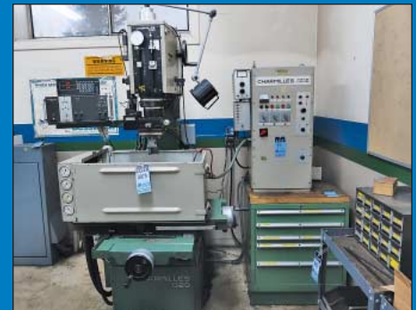
(2) Charmilles Die Sinker EDM's w/ Rotary Heads