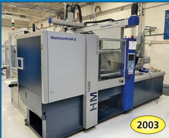
180 Ton Battenfeld Model HM-1600/750 Plastic Injection Molding Machine