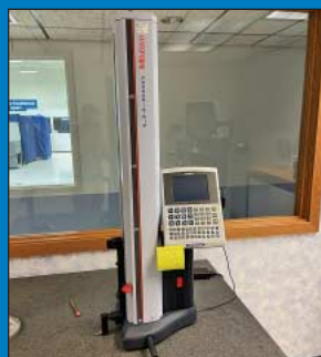
Mitutoyo LH-600 Height Gage