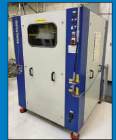
Battenfeld Type SE-33 Central Nitrogen Generator System