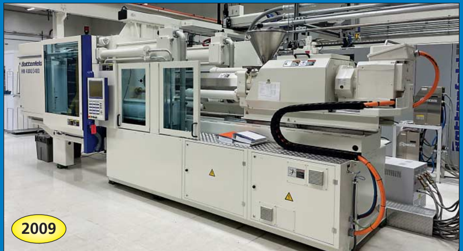
450 Ton Battenfeld Model HM-4000/3400 Plastic Injection Molding Machine

200 Ton x 11.49 Oz. Battenfeld Model HM-1800/1000 Plastic Injection Molding Machine; s/n 132227-100, Unilog B6S Control, 22.4" x 20.47" Distance Between Tie