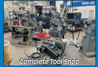
Complete Tool Shop