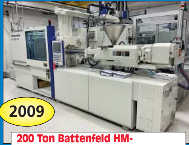
200 Ton Battenfeld HM-1800/1000 Injection Molder