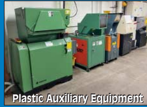
Plastic Auxiliary Equipment