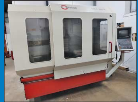
Hermle Model UWF-1001H Universal CNC Machining Center