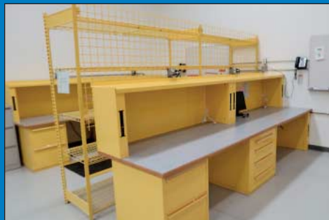
(100+) Lots Extremely Clean Shop Equipment