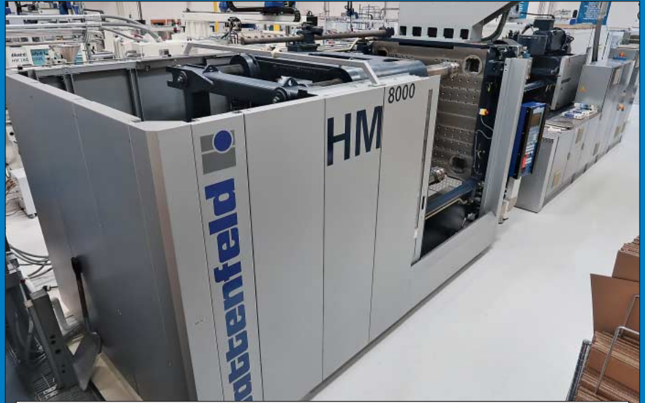
900 Ton Battenfeld Model HM-8000-2P/7700 Molding Machine