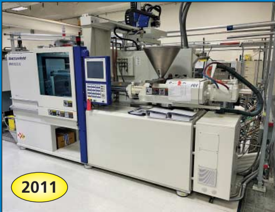
(2) 100 Ton Battenfeld Model HM-900/350 Plastic Injection Molding Machines