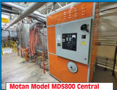
Motan Model MDS800 Central Dryer System w/ (12) Hoppers