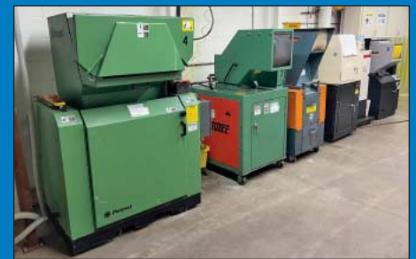
(6) Granulators to 14" x 24" by Rapid and Others