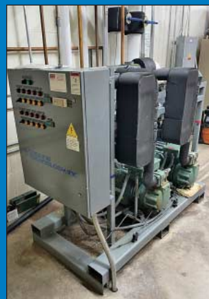
Cooling Technologies Central Chiller w/ Pump Tank