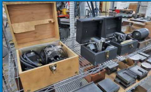
Large Quantity Tooling, Machine and Grinding Accessories