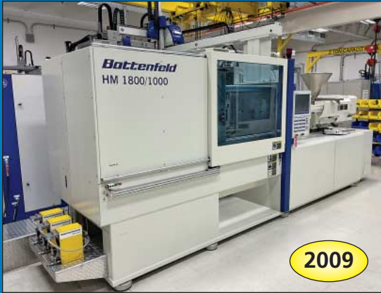
200 Ton Battenfeld Model HM-1800/1000 Plastic Injection Molding Machine