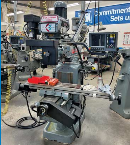
3-HP Clausing Kondia CNC Mill