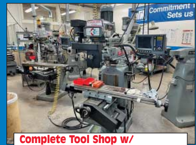
Complete Tool Shop w/ Machinery and Tooling