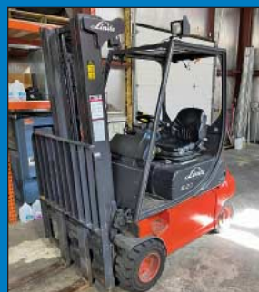
4,000 Lb. Linde E20 Sit Down Electric Forklift