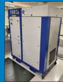
Bauer SNGII-30615 Central Nitrogen Generator System