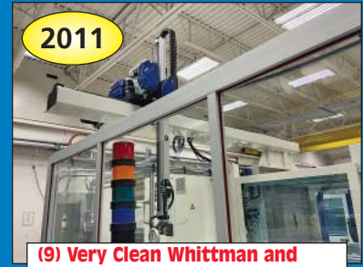
(9) Very Clean Whittman and Battenfeld Robots