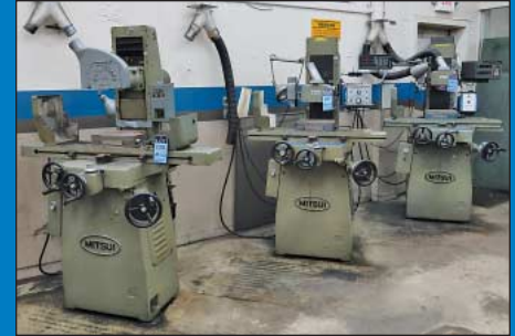
(5) 6" x 12" Mitsui Model 200MH Surface Grinders