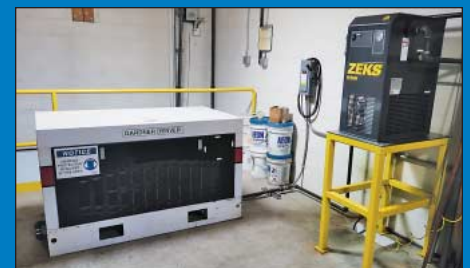
20 HP Gardner Denver Air Compressor w/ Zeks Dryer