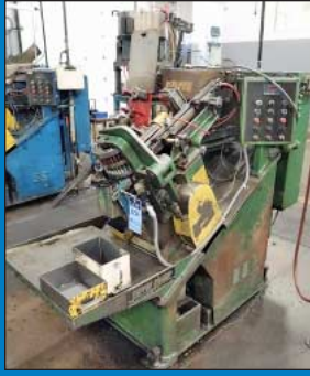
(3) 3/8" Warren-Betz Model WSS-476 Shank Slotters