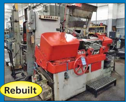
1/2" Tanisaka / Hartford Model 20-225 High Speed Thread Roller