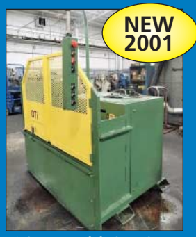
5/16" DTI Model 381-150TE Wire Drawer