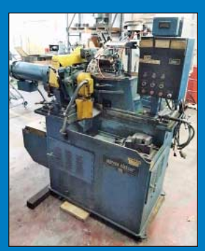
3/8" Warren Model WS-1000 Head Slotter