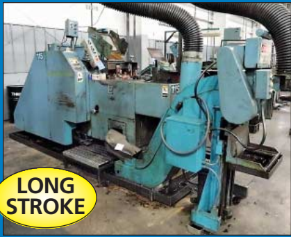
5/16" National Model 56 Long Stroke DSSD Cold Header