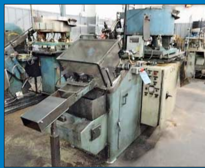
Videx Model VA-20 High Speed Planetary Thread Roller

Norling Model C545 Resistance Wire Heater; s/n 2767, 2KVA, .080-.310" Suggested Wire Size, 440 Volt, 54 Lb. / HP to 375 Degrees, Slider Contacts