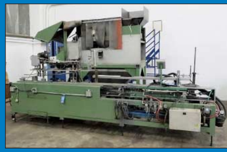
Imanpack SLR Packaging Line

Digital Platform Scale Zebra Label Printer (47) 36" x 36" x 18" Corrugated Steel Tubs