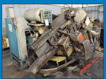
5/8" Waterbury Farrel Model 40 Hand Feed Thread Roller