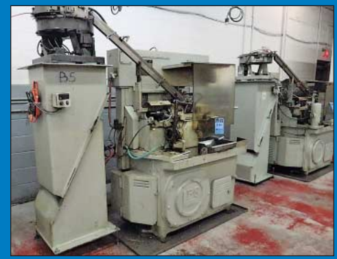
(3) 1/2" Brown and Sharpe Model OO Screw Machine