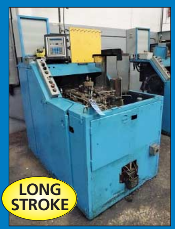
(3) 3/16" Waterbury "Hipro" DSSD Long Stroke Cold Header