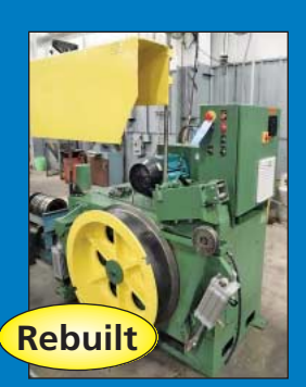
3/8" Daiya Model NID-10 Wire Drawer