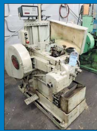
(6) 3/16" Waterbury "Hipro" DSSD