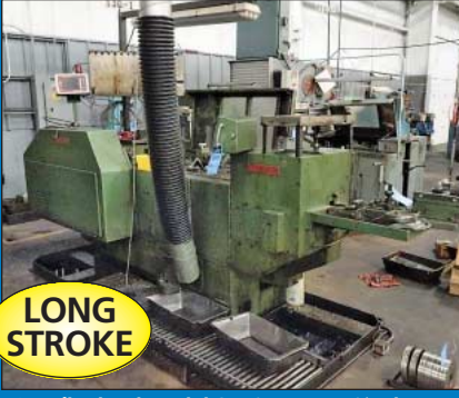
1/4" Hilgeland Model CH1SHA Long Stroke High Speed DSSD Cold Header