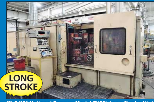
(2) 5/16" National Formax Model FX22L Long Stroke High Speed 2-Die 2-Blow Cold Header