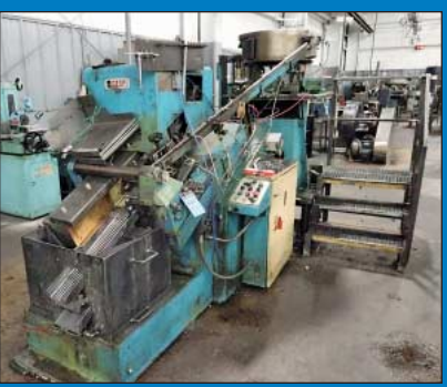
1/2" Saspi Model GV-3/20 High Speed Thread Roller