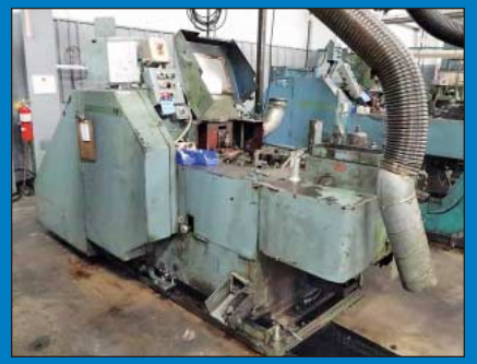
5/16" National Model 56 Standard Stroke DSSD Cold Header