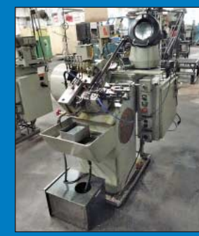
(2) 3/32" Waterbury Farrel Model "00" Incline Heavy Frame Thread Roller