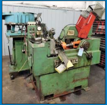
3/8" Hartford Model 6-600 High Speed Pinch Pointer