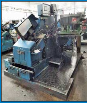
5/16" Saspi Model GV-2 High Speed Thread Roller