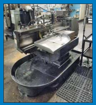
1/2" Waterbury Farrel Model 30 Heavy Frame Hand Feed Thread Roller