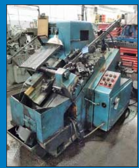
5/16" Saspi Model GV-2-20 High Speed Thread Roller