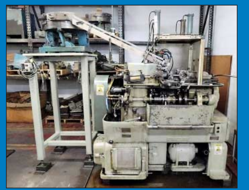
(2) 1-1/2" Brown and Sharpe Model 2G Screw Machine, Second OP Conversion