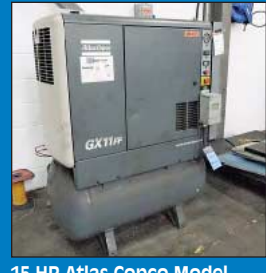
15 HP Atlas Copco Model GX11 Horizontal Tank Mounted Air Compressor