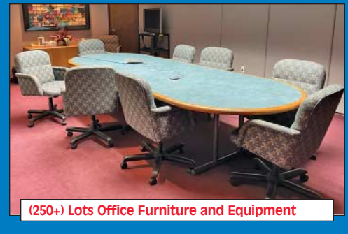
(250+) Lots Office Furniture and Equipment