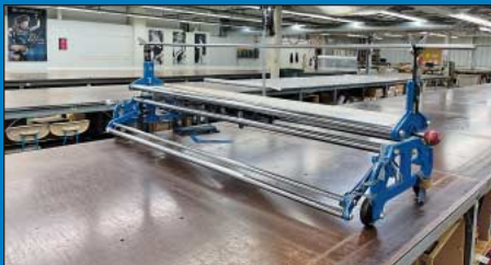
Numerous Cloth Spreaders and Layout Tables to 50'