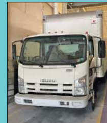
2012 Isuzu Diesel 24' Box Truck