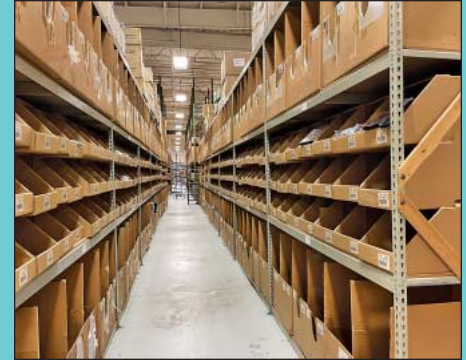
Large Quantity Steel Shelving