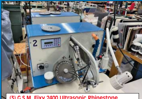
(3) G.S.M. Fixy 2400 Ultrasonic Rhinestone Machines