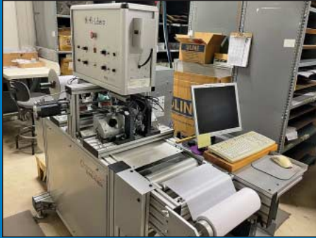
Nagel & Hermann - Libero Type 43048.A Automatic Rhinestone Hotfix Machine