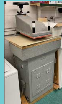
Herman Schwabe Model 1470 Clicker Press