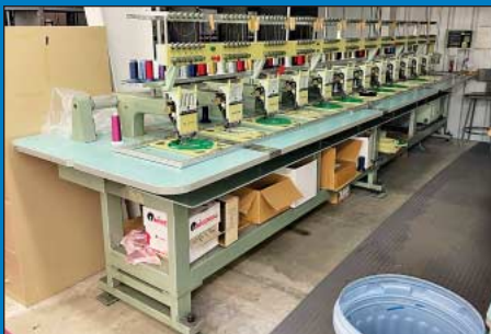
(2) Tajima Model TME-HC612 Twelve-Head Embroidery Machines