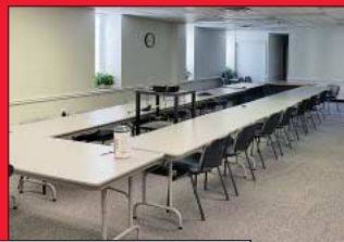
(250+) Lots Office Furniture and Equipment