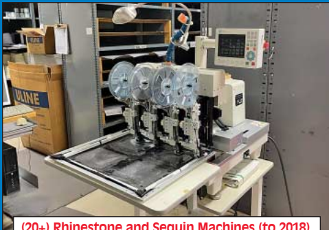
(20+) Rhinestone and Sequin Machines (to 2018)