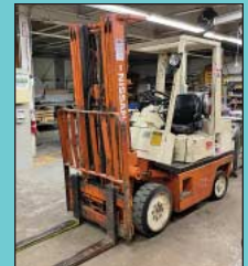
LPG and Electric Forklifts