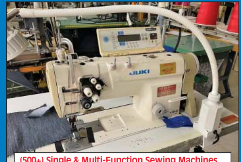
(500+) Single & Multi-Function Sewing Machines