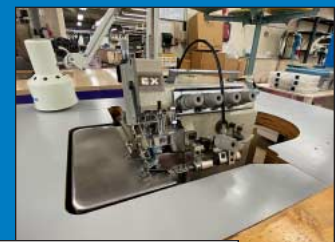
(500+) Single & Multi-Function Sewing Machines