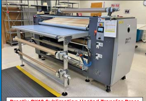
Practix OK10 Sublimation Heated Transfer Press (New 2019)