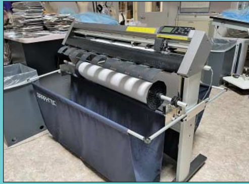
Graphtec Model CE6000-120AP Cutting Plotter