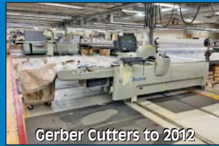
Gerber Cutters to 2012