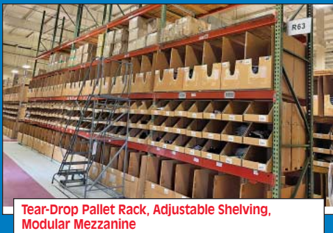
Tear-Drop Pallet Rack, Adjustable Shelving, Modular Mezzanine