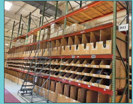
Large Quantity Tear Drop Style Pallet Rack