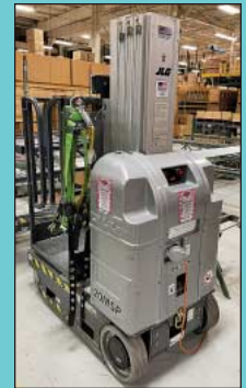
Forklifts, Man Lifts, Stackers, Pallet Trucks