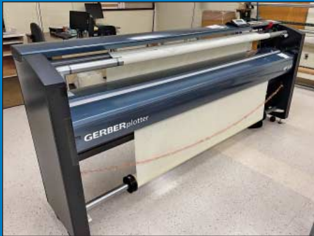
(2) 72" Gerber Plotters, Models MP-1800-4H and Infinity 2