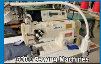
(500+) Sewing Machines