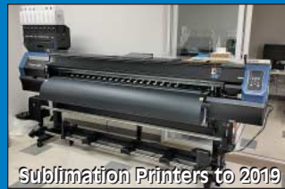
Sublimation Printers to 2019

Contact Information 2020 Dunlap St. Cincinnati, Ohio 45214 Phone 513-241-9701 Fax 513-241-6760 www.cia-auction.com