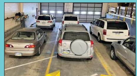
(6) Passenger Vehicles, (3) Minivans, (2) SUVs, (1) Sedan