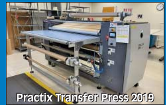
Practix Transfer Press 2019