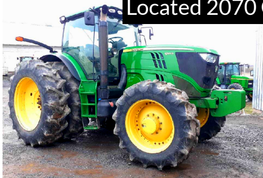
John Deere 6190 R

Located 2070 Camp Swatara Rd. Myerstown, PA 17067