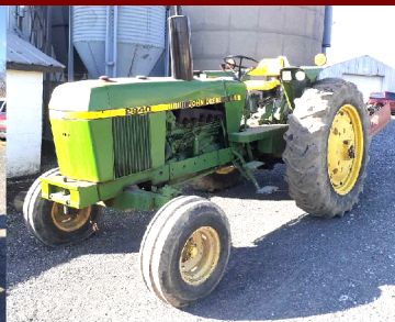
John Deere 2840