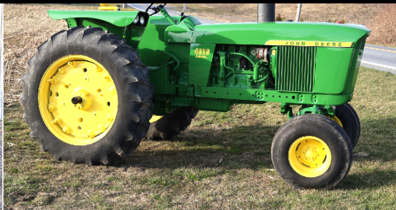
John Deere 4020