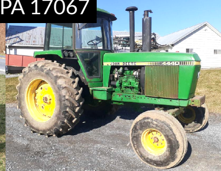
John Deere 4440