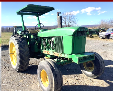
John Deere 4020