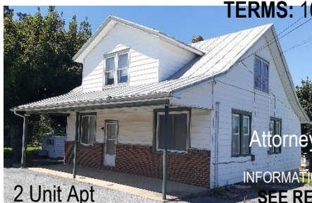
2 Unit Apt

TERMS: 10% Down at Auction, Balance in 45 Days.