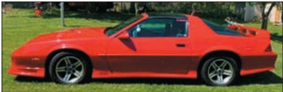
VEHICLE - 1991 Camaro Z28 (with T-Tops) 230HP 305ci TPI automatic with only 64,000 miles

Location: 300 S. Main St. North Liberty IN 46554 (Near water tower)