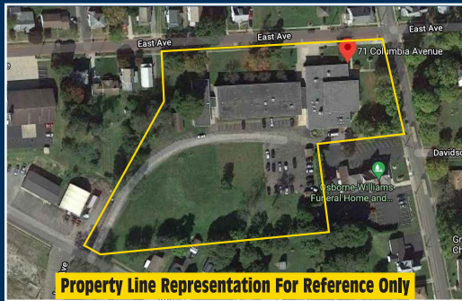
Property Line Representation For Reference Only

Go to loomisauctions.com & click on "Online Bidding" to view listings, video, images & bid!