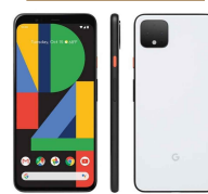
New Google Pixel 4XL, 64Gb, Unlocked