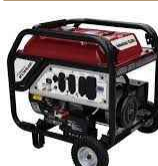
New AMP AK10KRS Commercial Gas Generator