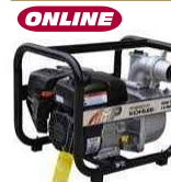
New AMP Kohler Series 3 In. Commercial Semi-trash Pump