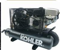
New AMP Kohler Series Commercial Air Compressor