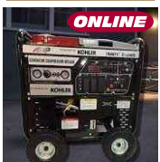
New Commercial AMP 9700 RES Welder / Gen Compressor