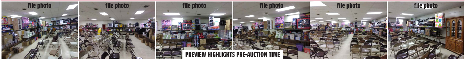
PREVIEW HIGHLIGHTS PRE-AUCTION TIME

SATURDAY, DECEMBER 4TH, AT 5:30 PM Doors Open / Registration @ 4:30 PM