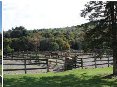
From the Farm there is Easy Access to Miles of Trails