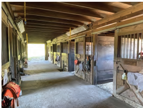
Turn-key Equestrian Center!