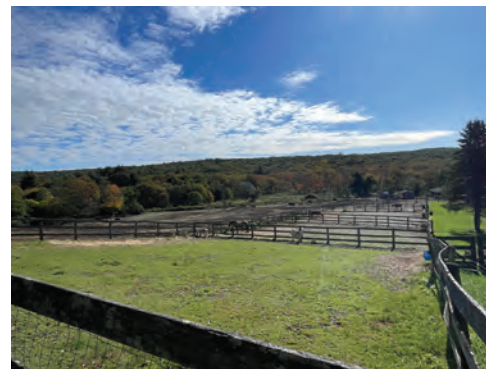
Plenty of Room for Boarding Horses or Other Livestock