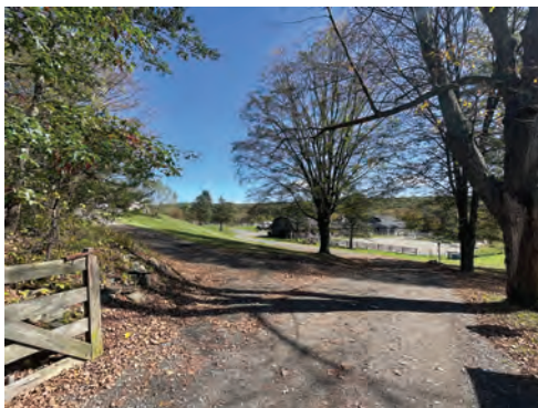
A Private Retreat with Nature

400 Union Valley Rd, Newfoundland (West Milford Twp), Passaic County, NJ 07435