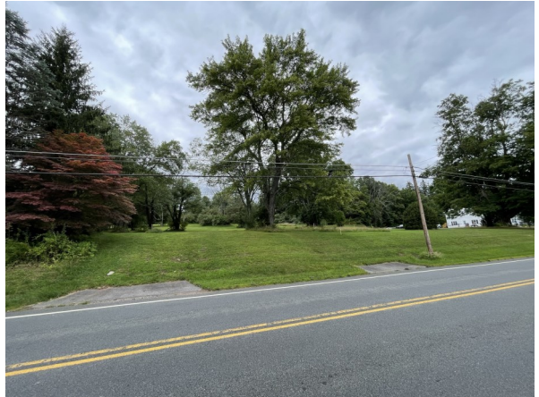
Make plans for a new home site in 2024