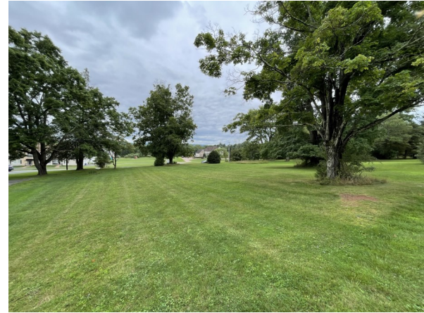
Beautiful vista point for your new home!