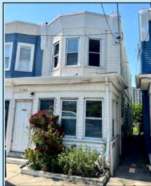
1109 Adriatic Ave