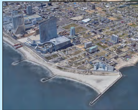
20 Beach Block Lots in the SE Inlet