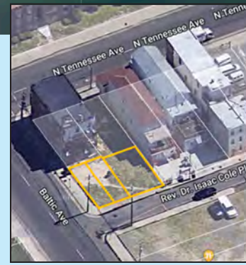
3 Lot Assemblage