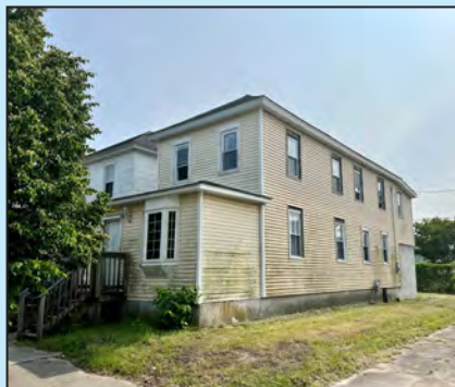
Bungalow Park Bungalow