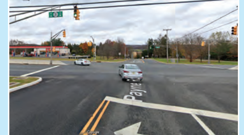
Signalized Intersection Route 31 & Payne Road