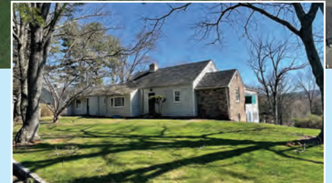
1132 Route 31 4,464 +/- SF - Multi Tenant Configuration