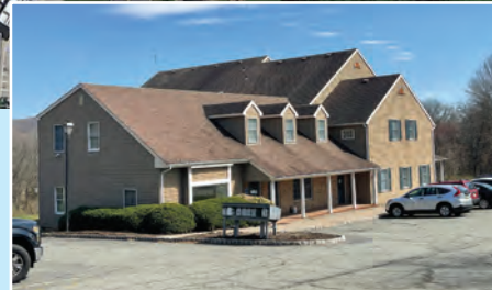
1128 Route 31 16,000 +/- SF - 7 Tenant Spaces