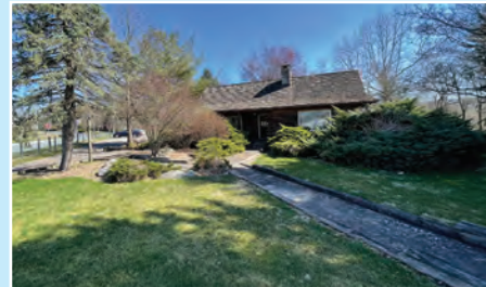
1136 Route 31 3,950 +/- SF - On Signalized Intersection