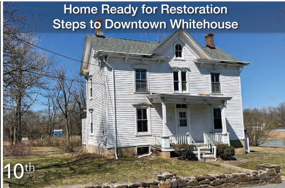
Home Ready for Restoration Steps to Downtown Whitehouse