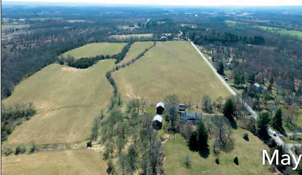
Private Farm on 55.6 +/- Acre Preserved Farmland