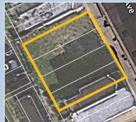
Four Contiguous Lots Sold Together