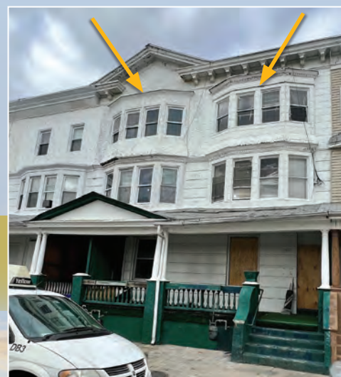
Two Homes Ready for Renovation