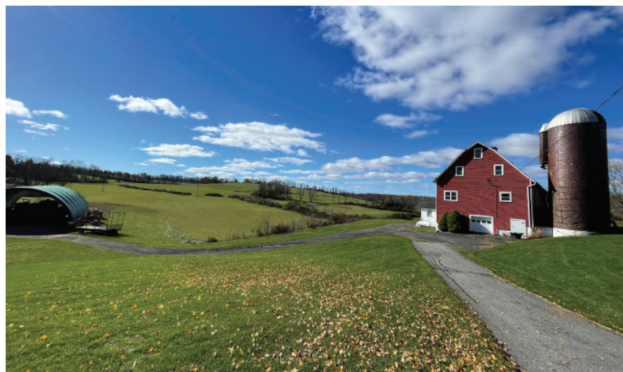
Farm operation ready to go