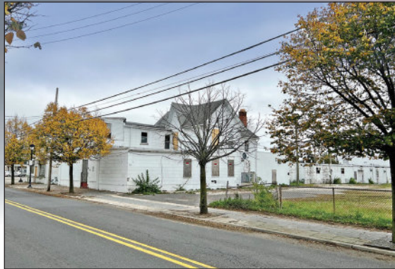
N. Main Redevelopment Opportunity