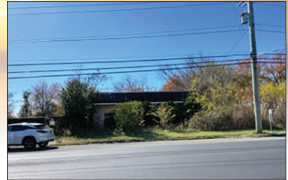
E. Delilah Commercial Location

Maxspann.com - The Go To Platform for Government Real Estate Sales