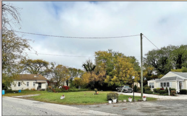
Properties Throughout the City