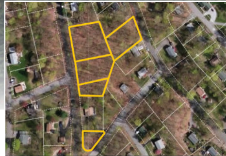
5 Lots Sold Together