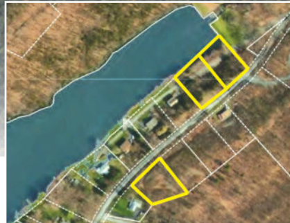
Lake front lots sold together