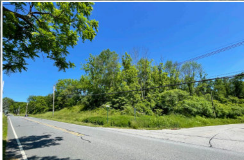
2.6+/- Acres Commercial Lot

Close to Highpoint, Mountain Creek and Crystal Springs