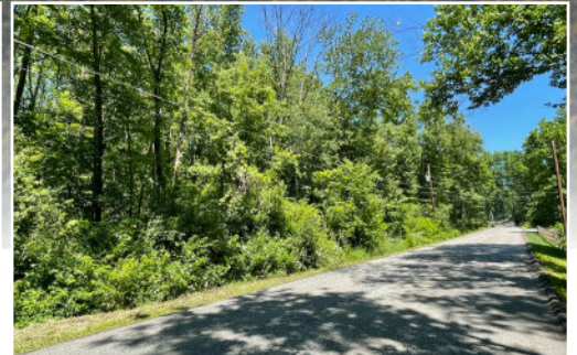
747+/- ft Frontage 10+/- Acres Possible Subdivision

SEPTEMBER 8 TH WANTAGE TWP, SUSSEX COUNTY, NJ