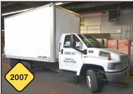
Chevy C4500 Box Truck

Miscellaneous Welding Accessories Incl. Tables, Clamps, Welding Curtains, Tips, Torches, Hoses, Kemper Fume Collector, Etc.