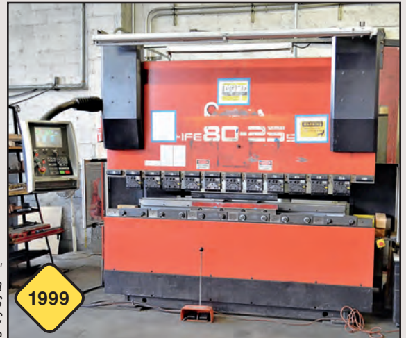
88-Ton x 8' Amada HFE-80-25S 8-Axis CNC Press Brake

Online Bidding Through BidSpotter.com Live Interactive Webcast Auctions