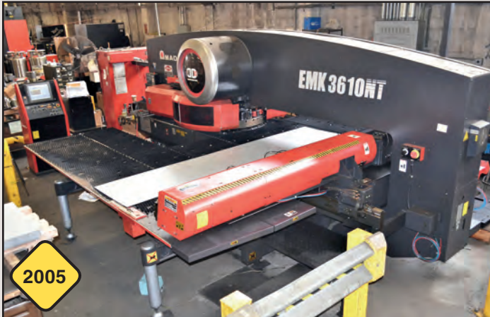
33-Ton Amada EMK3610NT Electro Servo Turret Punch