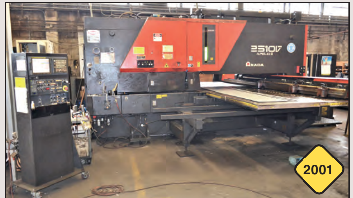
Amada Apelio III 2510-V 22 Turret Punch/2Kw Laser Combination