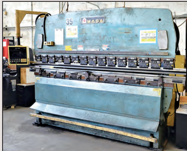
138-Ton x 10' Amada RG-125 CNC Press Brake