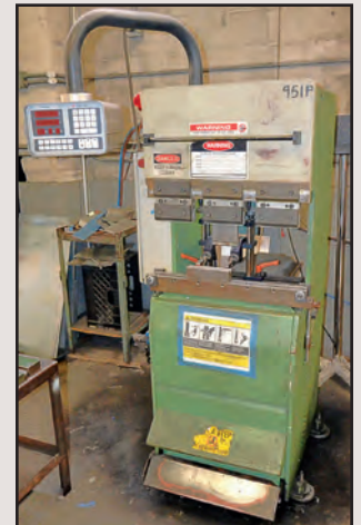
17.5" x 24" Guifil PE6-16 CNC Press Brake