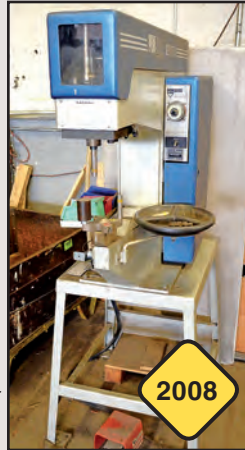
4-Ton Pemserter Series 4 Insertion Press