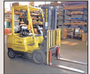
4,500-Lb. Hyster Mdl. S50XM Propane Forklift