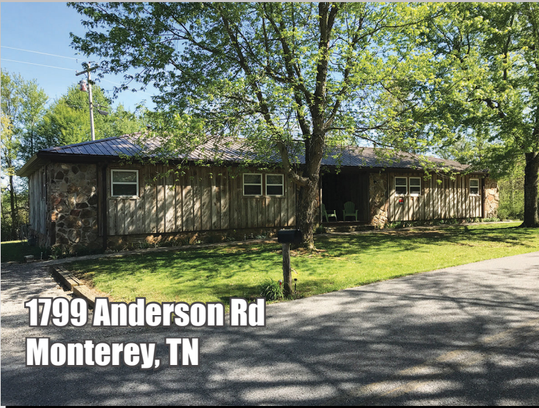
1799 Anderson Rd Monterey, TN

Starts Thursday, May 23, 12 Noon Ends Thursday, June 6, 12 Noon