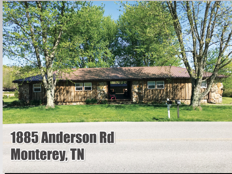
1885 Anderson Rd Monterey, TN

INCOME PRODUCING REAL ESTATE • EXCELLENT INVESTMENT PROPERTY