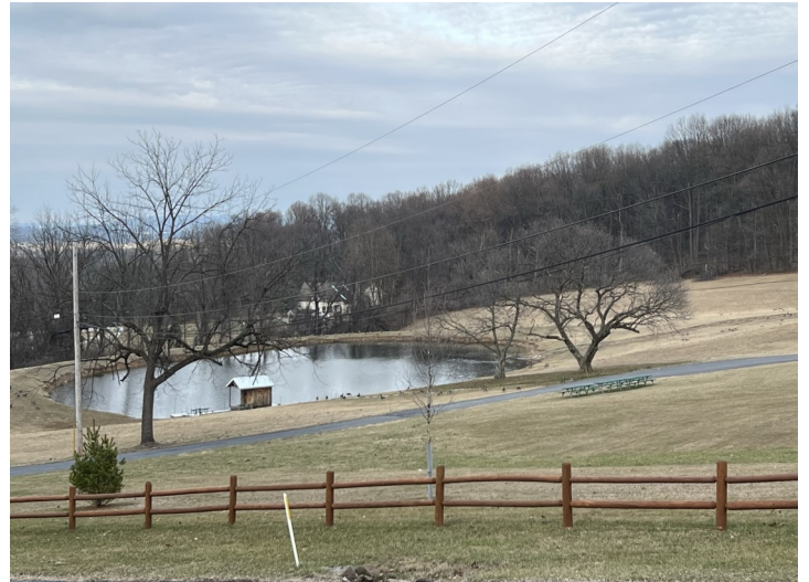
VIEW FROM FRONT OF HOUSE

LOCATION: 950 Hill Road, Wernersville, PA 19565.