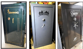
BROWNING & CANNON SAFES