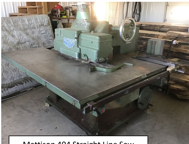
Mattison 404 Straight Line Saw