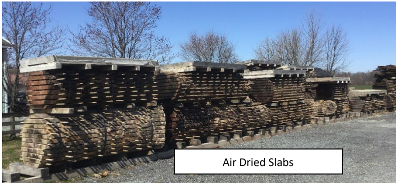
Air Dried Slabs

700 Nottingham Rd., Peach Bottom, PA 17563 - Lancaster County