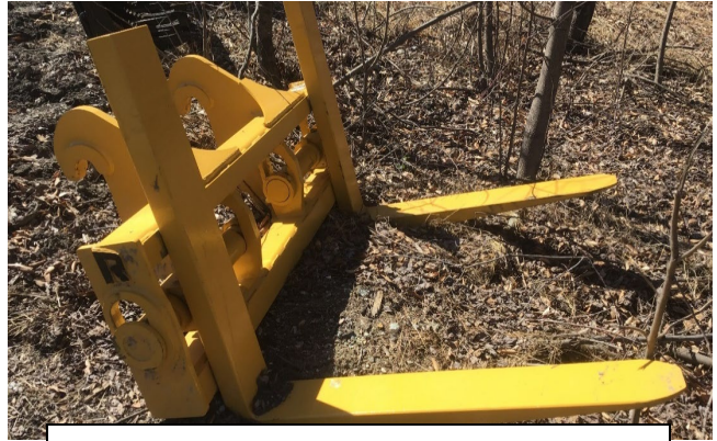
New 4' Rockland Forks