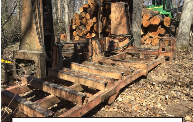
CTR Slasher Saw 60" Bar