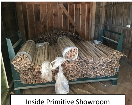
Inside Primitive Showroom