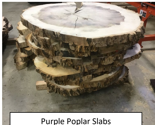
Purple Poplar Slabs