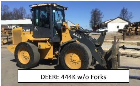
DEERE 444K w/o Forks