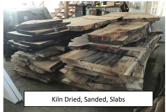
Kiln Dried, Sanded, Slabs