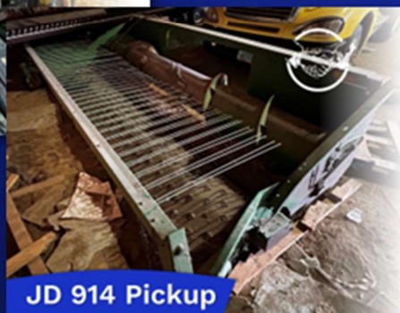
JD 914 Pickup