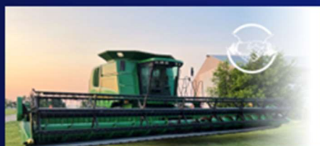
JD 635 Flex