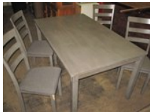
TABLE IS 60" X 36" X 30" AND 4 CHAIRS WITH PADDED SEATS - SHOWING SOME WEAR.