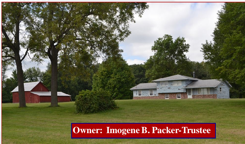
Owner: Imogene B. Packer-Trustee

Approx. 18 acres of woods & 12.6 acres pasture