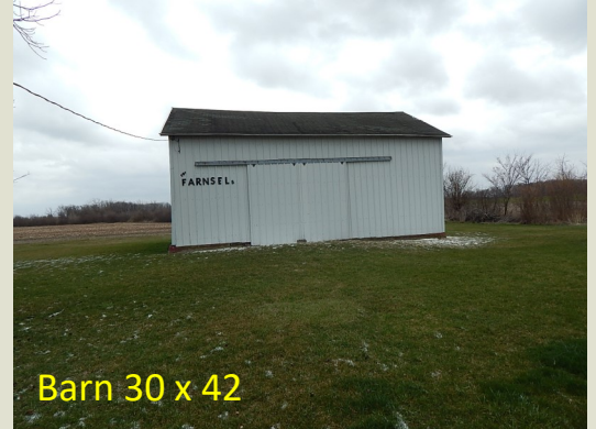
Barn 30 x 42

Part of Property in Flood Plain Near Creek (Not House)