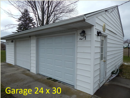
Garage 24 x 30