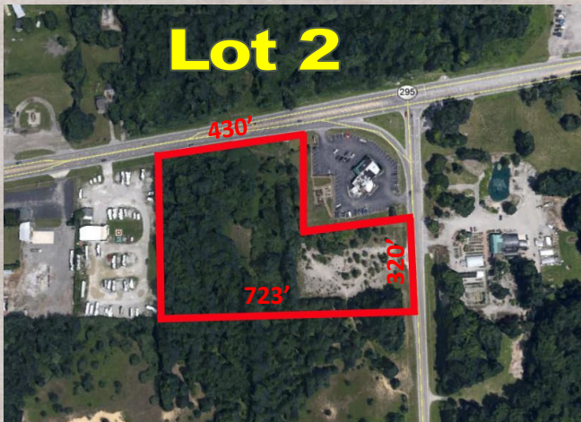
12455 Airport Hwy 7.2 Acres Parcel 7210554