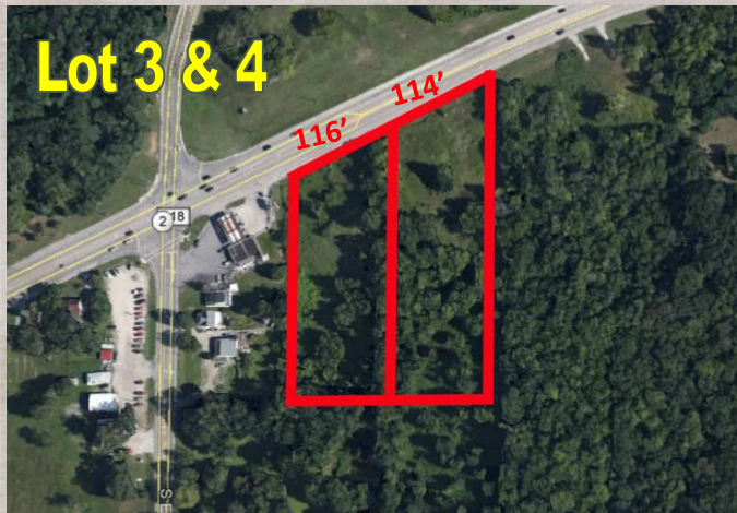
Lot 3 Airport Hwy 1.28 Acres Parcel 6533381