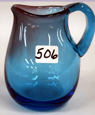
506 Dominick Labino 1967 pitcher, blue small pitcher, with a hint of red at rim, applied handle, 4.75" tall

Whalenauction.com 419-875-6317 info@whalenauction.com