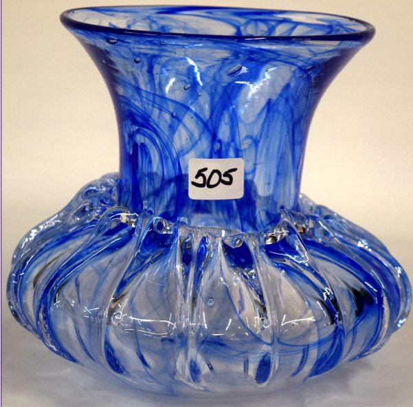
Eli Applebaum Spittoon, unusual clear with abstract blue design, applied ribbed glass on the bulbous portion of the base, 6.75" tall