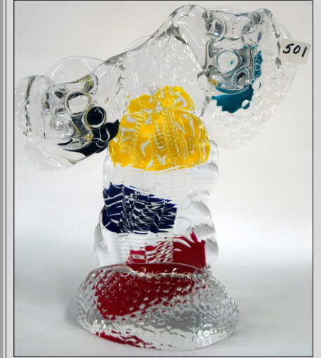
501 Leon Applebaum sculpture, 11.5" tall, clear multi-textured surface, patches of color on reverse, 2-pockets formed in the top, 10" diam.