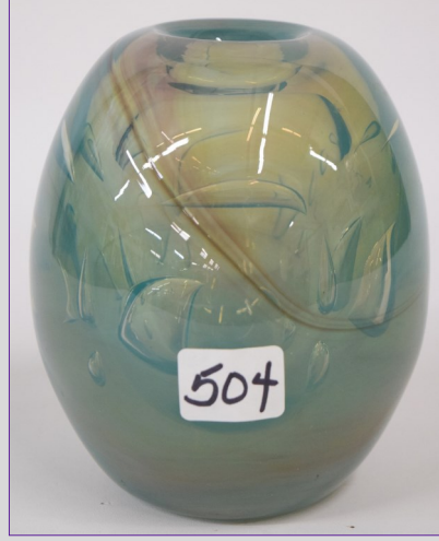
504 Dominick Labino 1972 heavy aqua vase, controlled air design, 5"