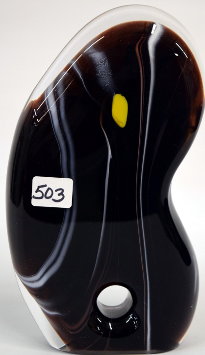
503 Leon Applebaum flat sculpture, dark brown with white vertical stripes, with yellow and orange. A hot tooled hole near the base, 9"