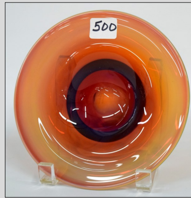
500 Dominick Labino 1976 low bowl, peach color, 6.25" diam, 1.25" tall