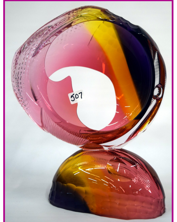
507 Leon Applebaum "Transformation" 2-piece sculpture in violet, amber & red, textured surface, highly polished, 14"