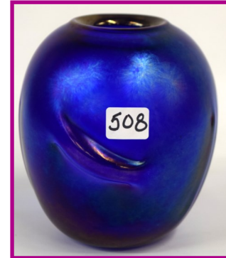
508 Dominick Labino 1975 cobalt blue vase, slightly iridized, tooled design in ovoid shape 6"