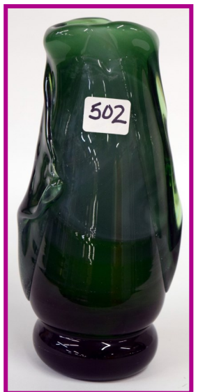
502 Dominick Labino 1965 early green vase, unusual color, milky swirl, 2 elongated prunts with fold over glass, footed, 8"