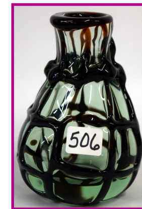
506 Dominick Labino 1970 clear green vase, brown net like lattice encasing 5.75" tall