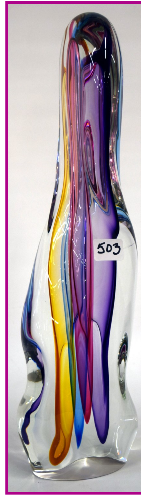
503 Leon Applebaum multi-color twist sculpture, 15.5" tall, clear with amber, blue, red & violet