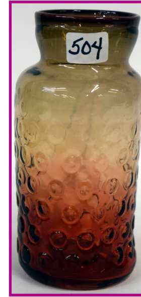
504 Dominick Labino 1965 rare vase, red/amber with textured surface, schmelz rim 6.5"