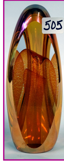
505 Ed Kachurik 2004 sculpture, amber exterior, faceted, two iridescent gold veils, controlled bubble 7.25"