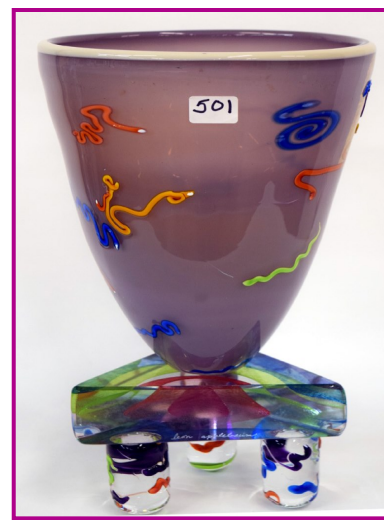
501 Leon Applebaum, whimsical vase, modernistic fun design, lavender color, many squiggles, base is clear triangle shape with 3 legs, 15.5" tall